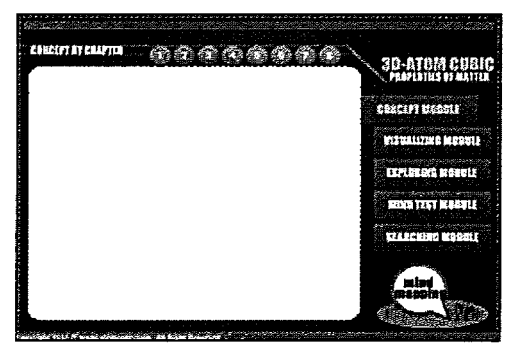
Fig. 7 Interface design of sub main module