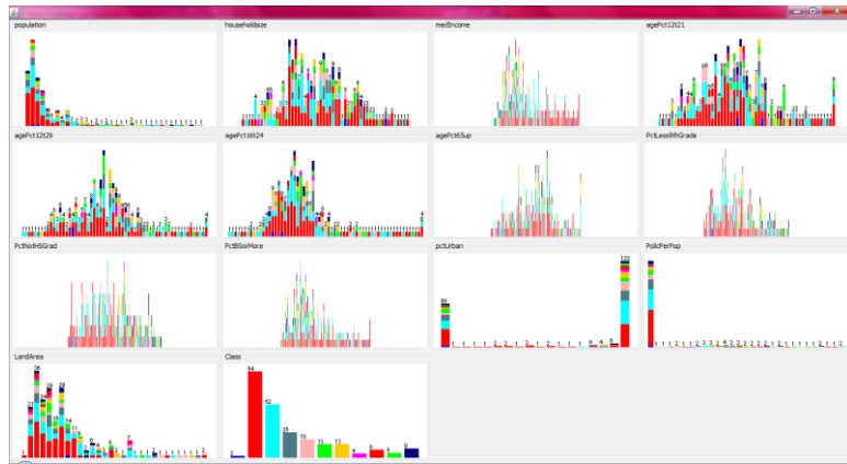
Fig. 6.2: Visualisation after pre-processing.

For Fig. 6.1, we focus on the class attribute which it is the predicted attribute. It rates the crime occurrence at a specific location. The red bar at the class attribute related to the other 13 attributes. We can see that the red bars are the majority of all attributes. This show that rate is the most popular or highest among all the attributes. Other rates also as same as explained.