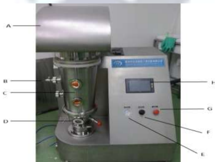
Fig. 2: The actual design of FLP 1.5 Mini Fluidized Bed Granulator used for granulation experiment, A. Exhaust Chamber, B. Top Spray Inlet, C. Granulation Chamber, D. Granules & AAI Port, E. Atomizing Pressure Gauge, F. Atomizing Pressure Regulator, G. On /Off Button, H. Touch Screen Monitor

Table 1 show a list of readings obtained from the previous study but have been screened and improved in this experiment for comparison and evaluation to determine the absolute temperature in the formation of urea granules. The temperature of inlet and outlet air regularly monitored through the operation panel. The other parameters were maintained as constant through OFAT method involving only one type of factors that change as well as being a major contributor in the characterization of the urea granule..