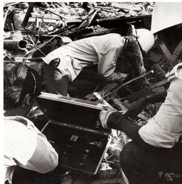
Fig. 4: Rescue operation [7].

After five day rescue operation, 17 people were rescued but 33 people were killed. Fig. 4 shows the rescue operation conducted at the day of collapse.