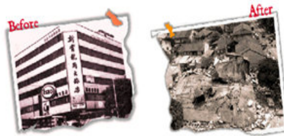
Fig. 3: Before and after the building collapsed.