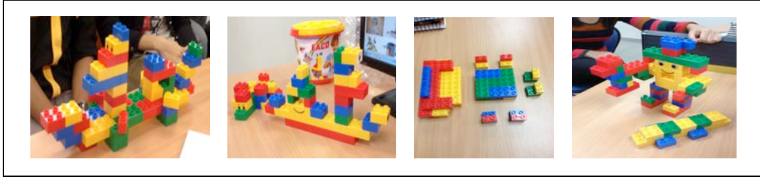
Figure 4: Building blocks sample product.