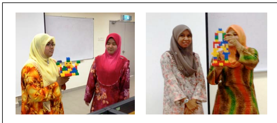
Figure 6: Presentation Session.

The presentation went smoothly for all teams where they have started with description of the product developed, justified the purpose of the design and elaborated the usefulness of the product which contributed to the community as a whole. The presentations also covered the opportunity to reason and argue among the students. The audiences basically enjoyed the question and answer session so much to disagree with, criticize or adding positive information to the presenter. The presenter principally defended their product with the ability of reasoning and positive communication. Figure 6 shows the presentation session.