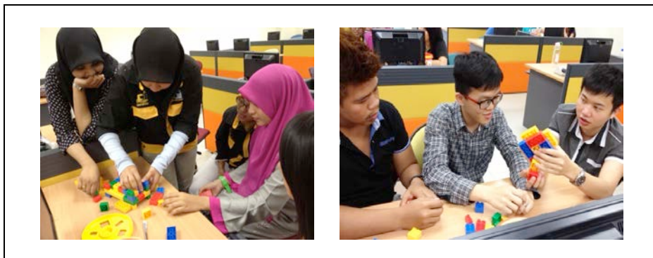
Figure 5: Building Block Session.

After the instruction was delivered, each team was given a tub of 53 building blocks to work with for the next half an hour. When the time starts, most of the team discussed and brainstormed the product they wanted to produce. In order to trigger good idea, it was observed that several teams used the computer to browse the Internet for any possible solution. On the other hand, there were several teams quietly tried to stack and join the blocks, break them and build again several times. It was observed that they tried to reason on every single move they made in a way to build something meaningful. There were also teams that argued with the team members before being able to achieve consensus. During the process, there were a few cases where the team changed their mind and decided to disassemble the blocks towards the end of the time given. They convinced themselves to develop something else instead. It was observed that these teams made such decision due to the uncertainty to justify the product design for the presentation. In conclusion, no matter how they handled the situation, eventually, all teams managed to produce something for the presentation in the time frame given. Figure 5 shows the building blocks activities.