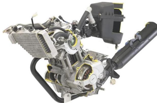
Figure 1. Yamaha LC135 engine [10].