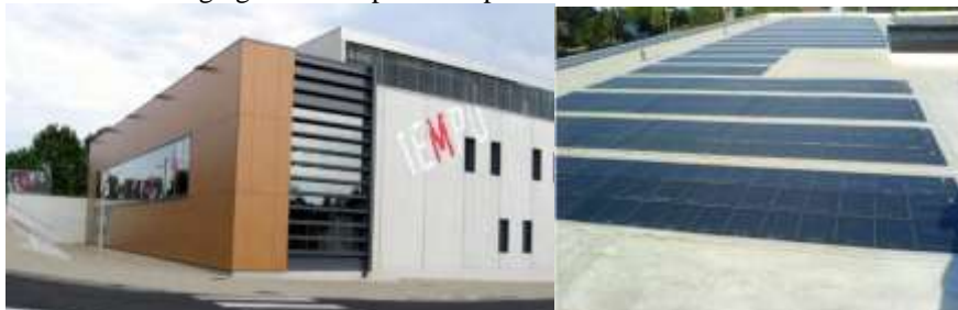
Figure 5 The municipal theatre 'TEMPO' with its roof covered with PV panels.