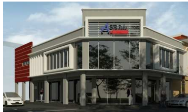
Fig. 1 Exterior of ASR Padu Sdn. Bhd

The office building was proposed for refurbishment and upgrade GBI certification which comprises new façade on its current building. Refurbishment of the shop house interior and exterior includes replacement of glazing and remodeling of some areas in the shop interior. Figure 1 shows the illustration of exterior of ASR Padu Sdn. Bhd.