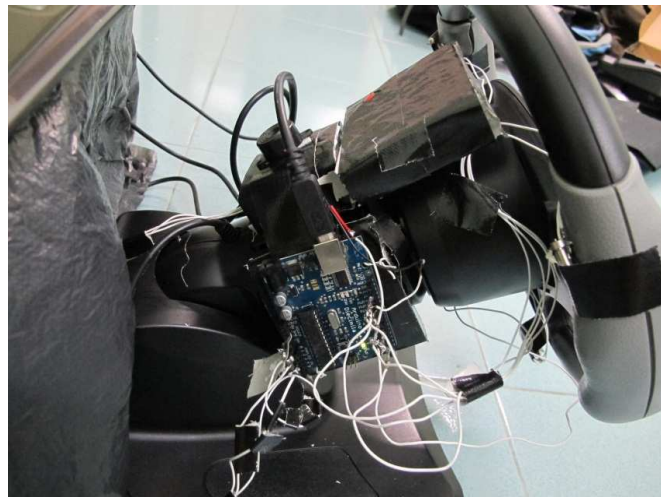
Figure 3. Actual prototype