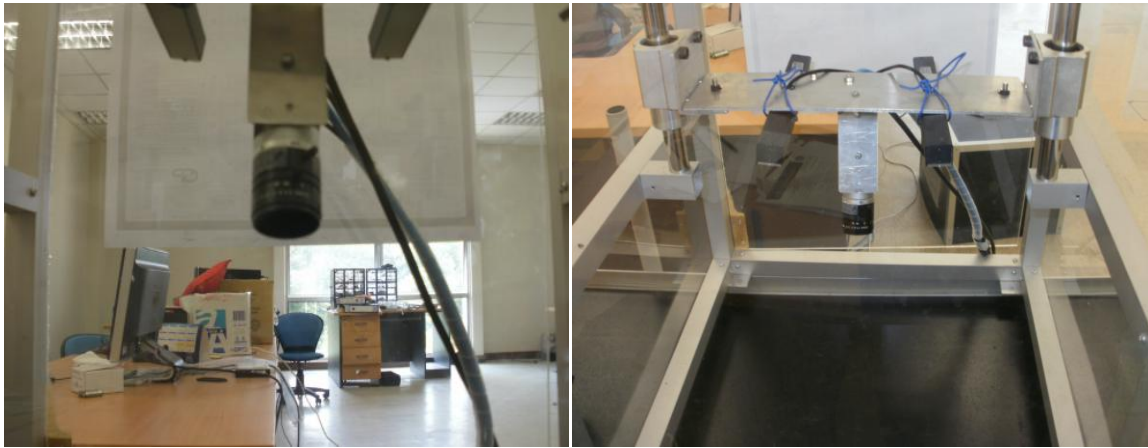
Fig. 1. Experimental Setup for capturing images of industrial samples, (left) the CCD camera (right) camera and bar light.

The proposed method is evaluated on a Core2Duo 1.83-GHZ computer with 2 GB RAM and MATLAB. There are two types of objects that are used for the experiments. The first type represents the sample of inhomogeneous objects which are fish and toys images. These images can be obtained on Tan's homepage website (please check on the last reference). The second type represents the sample of objects with stronger specular reflection. The experimental setup is shown in Fig. 1.