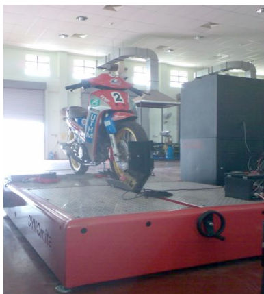
Figure 7 – Dynapack chassis dynamometer