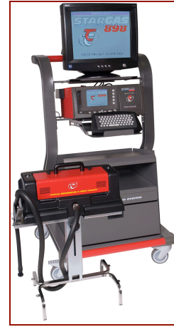
Figure 4 - Stargas 898 OBD scanner and gas analyzer

Looking at the capabilities of these two laboratories in UTeM, the potential research work to be explored in automotive industries is endless. In addition to fundamental combustion works, engine management system (EMS) development has become one of the important areas to be investigated by UTeM researchers. Some early works in EMS have begun in UTHM and UMP, and UTeM will enter this joint effort to further contribute to the automotive development in Malaysia. The centre also carried out evaluation and assessment on technologies for fuel economy and performance improvement.