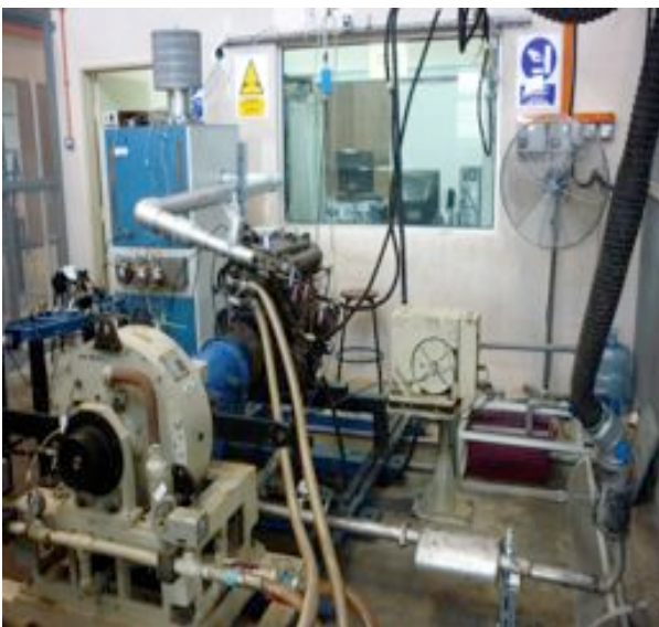
Figure 5 - Engine test cell layout in UMP

An exhaust gas analyzer KANE systems complete with a 3-meter long sampling probe is used for emissions measurements. The sampling probes of smoke meter and gas analyzer are mounted centrally at the end of the engine exhaust pipe.