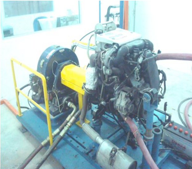
Figure 2 - Diesel engine on MD-DGEC150 Dynamometer