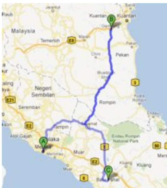
Figure 1 – Locations of UTeM, UMP and UTHM

Figure 1 shows the locations of the universities – (A) Universiti Teknikal Melaka, Melaka; (B) Universiti Malaysia Pahang, Gambang, Pahang and (C) Universiti Tun Hussein Onn Malaysia, Parit Raja, Batu Pahat, Johor. Those universities are located in the southern Peninsular of Malaysia and are easily accessible via the main highways. In Pahang, UMP is very close to the Pekan automotive key player, DRB-HICOM. Meanwhile UTeM in Melaka is near to local HONDA assembly plant and vendors. UTHM, the furthest south, although not close to major automotive manufacturers/assemblers, it is nearby to local assembler Oriental Assemblers Sdn Bhd. Apart from the automotive related industries, these universities are within reach to other kind of industries – processing (oil, chemical, biodiesel), manufacturing and production.