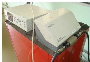
Figure 9 – Ono Sokki fuel consumption meter