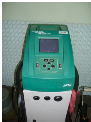
Figure 8 – AUTOCheck Analyser