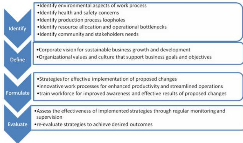
Fig. 1: Integrated Business Model