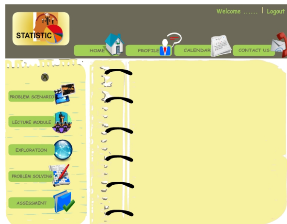
Figure 3: Home Interface