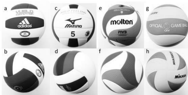
Figure 1. Volleyballs and the panel orientations used in this experiment: Adidas (a, b), Mizuno (c, d), Molten (e, f), and Mikasa (g, h).

A circuit flow-type wind tunnel at the University of Tsukuba was used. The maximum wind speed was 55 m/s, blow out size was 1.5 m × 1.5 m, wind speed and turbulence distributions were within \pm 0.5\% and less than 0.1%, respectively. Volleyballs were installed in the wind tunnel. In this experiment, the panel orientation of the volleyball was split into two (orientation A, B; Figure 1) and the aerodynamic characteristics in each orientation were measured. Panel orientation A had the logo at the center front and orientation B had the place wherein the seam intersects at the center front. The air force of each ball was measured in the range of wind speeds ( U ) from 7 to 35 m/s using a Sting-type 6-division detector (LMC-61256, Nissho Electric Works).