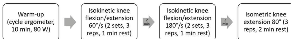
Figure 1: Strength testing procedure.

Bilateral strength of quadriceps femoris and the hamstring muscles was tested by isometric and isokinetic maximum voluntary contractions (MVC) at different speeds (60, 180, 0 °/s) with an isokinetic dynamometer (IsoMed 2000, D&R Ferstl GmbH, Hemau, Germany). For all MVC maximum moment of force and contraction work (integral of torque over angular position) were calculated. Measurements were always performed in the same order after a 10 min, 80 W warm-up on a cycle ergometer (wattbike pro, Nottingham, UK) starting with the right leg (Fig. 1). Data were analysed using the ISA software (CSI, Bad Schönborn, Germany).