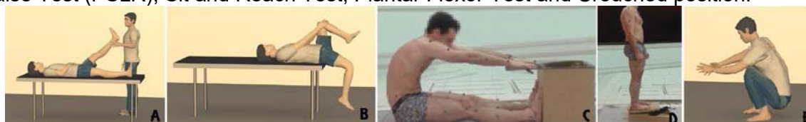
Figure 1: Illustration of the five static stretching tests used in this study to extract the maximal muscle length (Lstat). A: Modified Thomas test. B: Passive Leg Straight Raise Test (PSLR). C: Sit and Reach Test. D: Plantar Flexor Test. E: Crouched position.

After a routine warm-up, participants were tested for 30 seconds at 20 cycles / minute, 32 cycles / minute and race pace on a Concept2 Dynamic Indoor Rower (Concept2, USA). Ten consecutive cycles were selected in the middle of each trial. The catch and finish events of the ten cycles were automatically detected to time-normalised [0, 100%] and time-averaged for the 10 cycles the length of 15 muscles. The muscle length was normalised with the maximal muscle length (Lstat) computed by Opensim 3.2 routines from five static stretching tests performed by participants (Figure 1): Modified Thomas Test, Passive Leg Straight Raise Test (PSLR), Sit and Reach Test, Plantar Flexor Test and Crouched position.