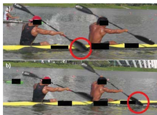
Figure 2: Examples of offset types within a sprint kayak K2 crew at the catch position. The catch occurs when the paddle blade first contact the water. (a) A negative offset is where the back paddler's blade contacts the water before the front paddler's. (b) A positive offset, where the front paddler's blade contacts the water before the back paddler's. A zero offset (not shown) is when both paddle blades contact the water at the same time.

To quantify stroke synchronisation within a K2 crew, an offset variable was defined as the timing difference of the back paddler with reference to the front paddler. The offset was measured for each of the four phase-defining positions (catch, immersion, extraction and release) of every right stroke for both paddlers, beginning from the 4 th right stroke. The first three strokes on the right were excluded as there were large differences in the water phase duration compared to the subsequent strokes. The offset of the back paddler could be negative, zero or positive (Figure 2).