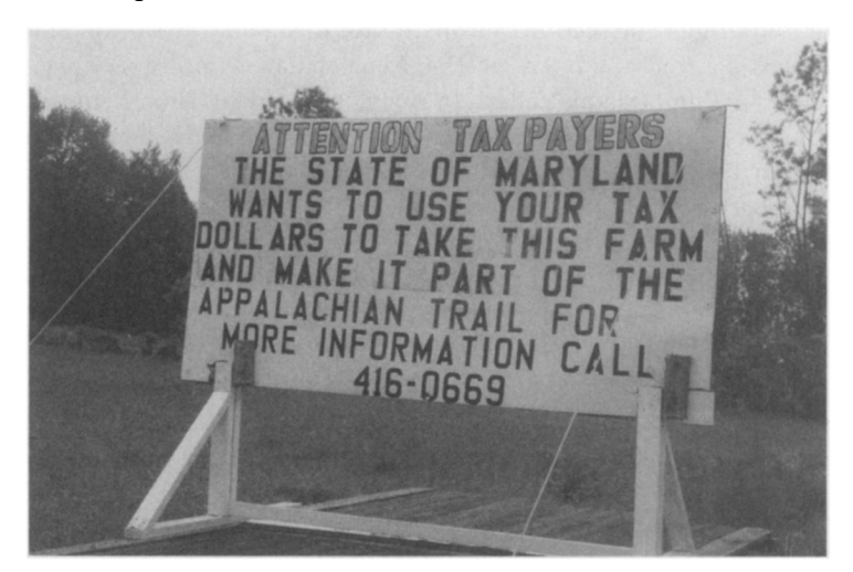
Figure 6. Local Landowners Express Their Concerns about the Federal Land Acquisition Program.