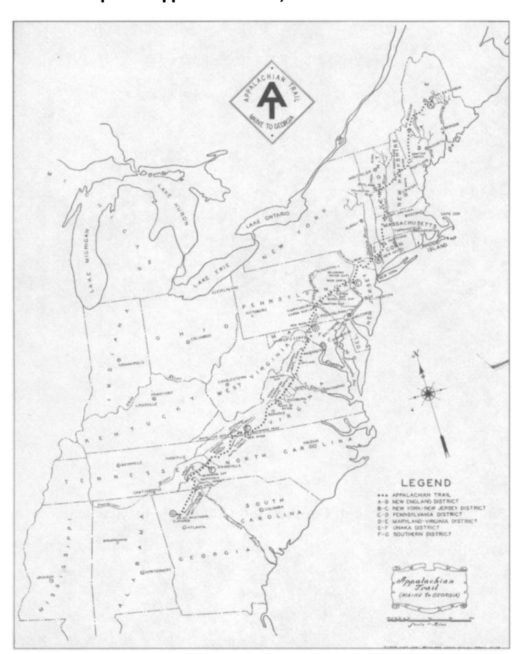
Figure 2. The Completed Appalachian Trail, 1937.

The Appalachian Trail Conference used a federated structure of local clubs to promote trail-building efforts in the 1920s and 1930s. Without federal authority, the project relied on the ability of trail volunteers to cultivate positive relationships with local landowners. Credit: Map created by the Potomac Appalachian Trail Club.