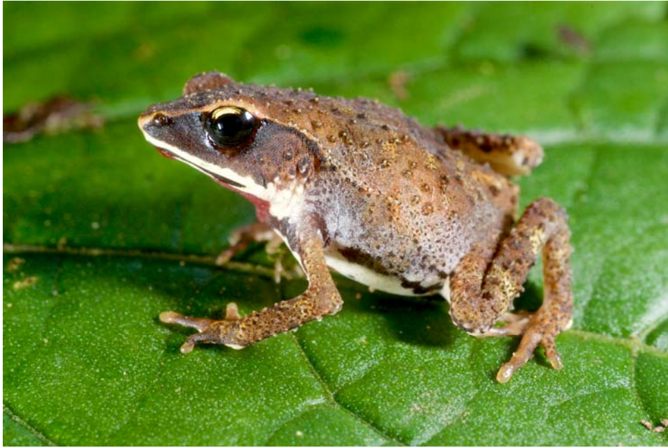
Figure 3. The Critically Endangered Nectophrynoides wendyae , endemic to the Uzungwa Scarp Nature Reserve.

The Kihansi spray toad Nectophrynoides asperginis , listed as Extinct in the Wild on the 2009 IUCN Red List, was successfully reintroduced into its native habitat in the Uzungwa Scarp Nature Reserve in October 2012 (IUCN, 2012c). However, because a species is required to remain in its original category for a time period of five years from the time it no longer meets the criteria for that category (IUCN Standards and Petitions Subcommittee, 2014), it remains listed as Extinct in the Wild on the 2015 Red List (IUCN SSC Amphibian Specialist Group, 2015). The Critically Endangered Nectophrynoides wendyae (figure 3), also endemic to the Uzungwa Scarp Nature Reserve, was reported in 2011 from a second site, 0.5 km from the original site (BirdLife International, 2013), while the other Critically Endangered species of the genus from the Udzungwas, N. poyntoni , is only known from one locality and last seen in 2003 despite recent surveying (Menegon, pers. obs.).