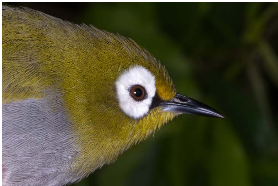
Figure 5. The Taita white-eye Zosterops silvanus .

The montane white-eye Zosterops poliogaster Sibley & Monroe, 1990 was split into Z. poliogastrus Heuglin, 1861, Z. kulalensis Williams, 1948, Z. winifredae Sclater, 1934, and Z. silvanus Peters & Loveridge, 1935 by Collar et al. (1994), but the plumage differences on which this was based were not considered sufficient to justify the separation of these species (BirdLife International, 2014c). As a result, the previously globally threatened Taita white-eye Z. silvanus (figure 5) and the South Pare white-eye Z. winifredae were lumped into the montane white-eye, now listed as Least Concern (as Z. poliogastrus ; BirdLife International, 2012). However, recent molecular evidence (Cox et al. , 2014) strongly suggests that the Taita white-eye and the South Pare white-eye are good species separate from the montane white-eye; if accepted this new evidence would result in the restoration of these two species to the EACF Outcomes Database.