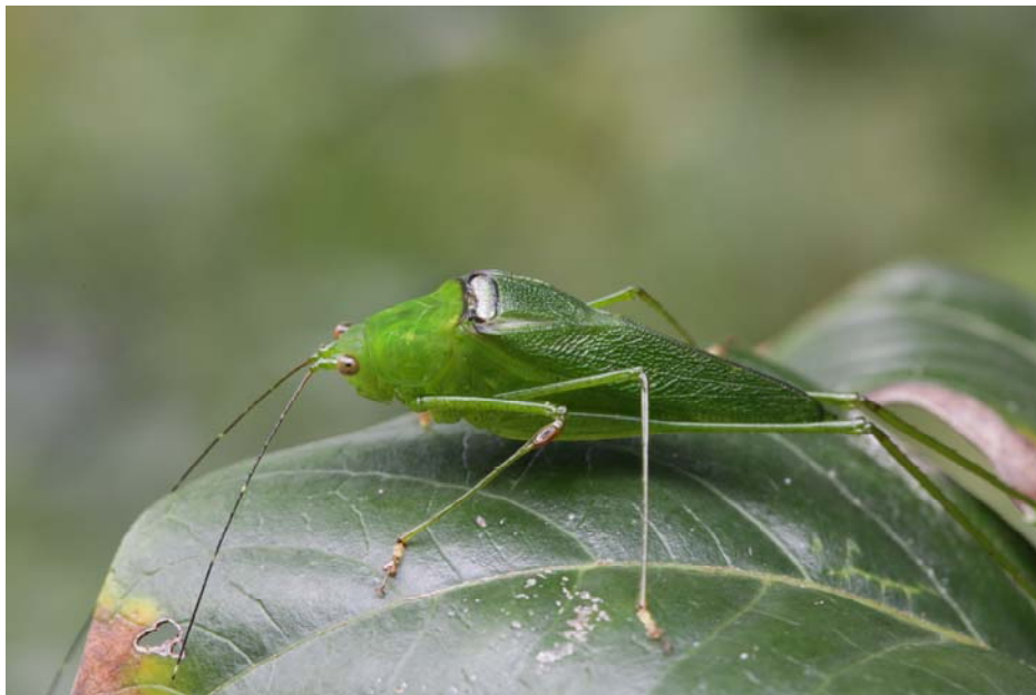
Figure 11. The inflated tree bushcricket Euryastes jagoi (male) is restricted to forests of the West Usambara Mountains; a second population was detected in 2014 in Lutindi Forest.