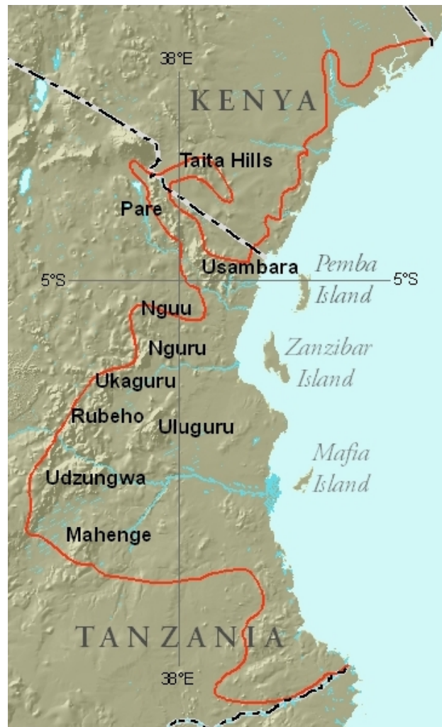
Figure 1. Eastern Arc and Coastal Forests Project Area, with Eastern Arc mountain blocs and major offshore islands labelled.

The Eastern Arc Mountains and Coastal Forests of Kenya and Tanzania (EACF) region (figure 1) is characterised by a high level of species endemism, a severe degree of threat, and the exceptional diversity of its plant and animal communities (Critical Ecosystem Partnership Fund, 2003a, 2007). Myers et al. (2000) recognised the EACF as one of the world's 25 Global Biodiversity Hotspots on the basis of its having at least 1500 endemic plant species and having lost at least 70% of its original primary vegetation. Brooks et al. (2002) concluded that the EACF is the one Hotspot likely to suffer the most extinction events from a given loss of habitat. Mittermeier et al. (2004), however, later separated the Eastern Arc Mountains (EAMs) as part of a newly recognised Eastern Afrotropical Hotspot and included the Coastal Forests of Kenya and Tanzania in an expanded Coastal Forests of Eastern Africa Hotspot.