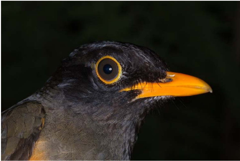
Figure 7. The Critically Endangered Taita thrush Turdus helleri .

The long-billed tailorbird occurs at low density in two widely separated forests, the East Usambaras in the EACF, Tanzania, and the Njesi Plateau in northern Mozambique, with its global population tentatively estimated at 50-250 individuals (BirdLife International, 2014c). Borghesio et al. (2014a) studied the habitat use of the long-billed tailorbird and showed that it only occurs inside or along the edges of continuous forest, rarely in forest fragments, and that its abundance is significantly depressed in sites invaded by the exotic tree Maesopsis eminii Engl. (Rhamnaceae) in the East Usambaras. Borghesio (2012) suggested that invasion by M. eminii had highly significant negative effects on frequency for 5 out of 11 rare bird species, including the long-billed tailorbird and the Near Threatened Fischer's turaco, Tauraco fischeri (Reichenow, 1878); however, it remains to be determined what factor associated with Maesopsis eminii may contribute to reduced abundances of various threatened bird species.