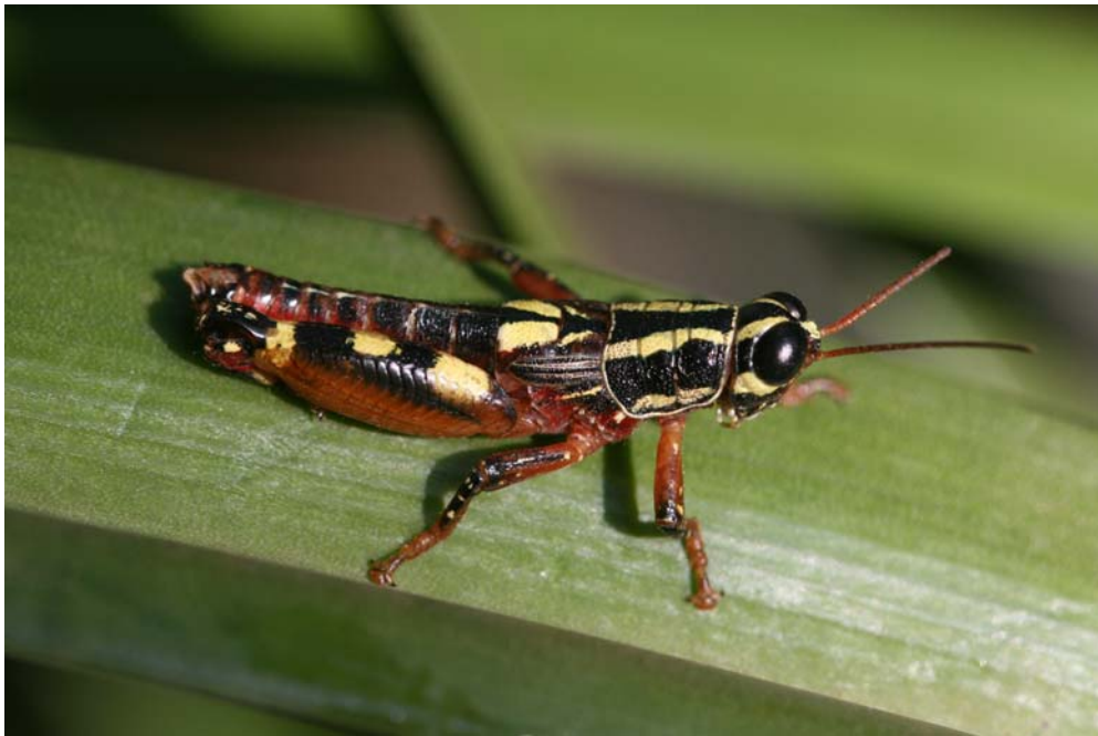
Figure 8. The Critically Endangered Zanzibar giant forest grasshopper Allaga ambigua (male) was recently discovered on the eastern slopes of Mount Kilimanjaro.

information existed until recently for this flightless species of Acrididae subfamily Catantopinae. On Mount Kilimanjaro it was collected in savanna habitats, where it was caught at night from bushes and small trees. Nymphs appear in May and adults were found from May to October. It may have been overlooked because of its seasonality and because it is nocturnal and living on bushes and trees. This species has rarely been collected and might occur in similar habitats, e.g. in the North and South Pare Mountains and/or elsewhere in northern and central Tanzania. Another Critically Endangered species of Catantopinae, the fully winged Usambara splendid grasshopper Anischnansis burtti , seems to be restricted to the wet evergreen forests of the East Usambara Mountains (Sigi and Mlingano). It was last collected in 1966 and has not been recorded since then. The Critically Endangered Uluguru forest grasshopper Burtia sylvatica is also in Acrididae subfamily Catantopinae. Only a few specimens have been collected, all from forests of the Uluguru Mountains, where Hochkirch (1998) reported it from the Uluguru North Forest Reserve. The latter two species are both in monotypic genera, indicating that they are relicts having survived in the geologically old forests of the EAMs.