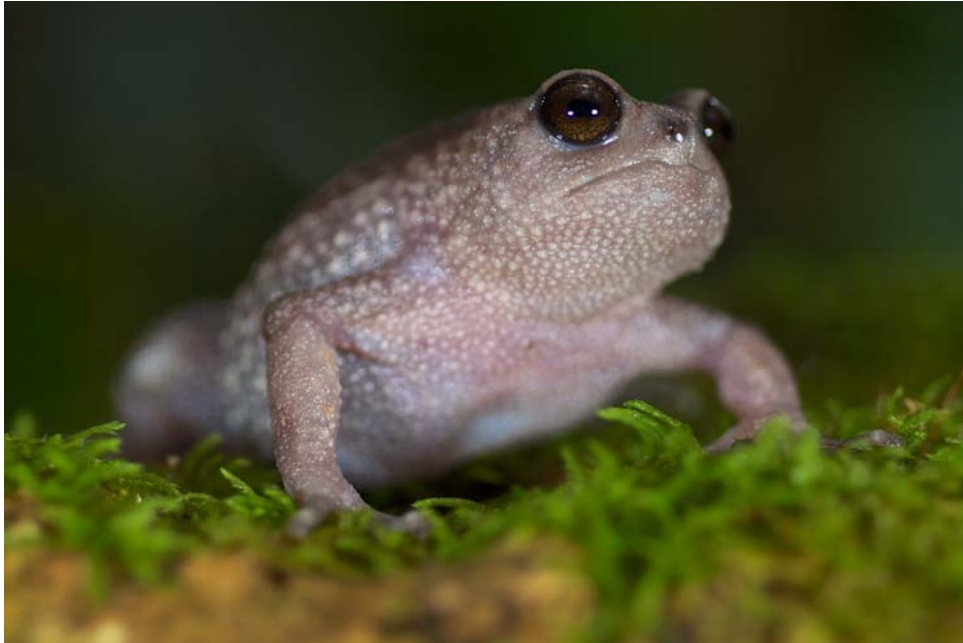
Figure 4. The Critically Endangered Callulina shengena , endemic to the South Pare Mountains.

Callulina meteora ); Ukaguru ( Churamiti maridadi ; Nectophrynoides laticeps ; Nectophrynoides paulae ); Uluguru ( Arthroleptides yakusini ; Nectophrynoides laevis Menegon, Salvidio & Loader, 2004 [Data Deficient 2014]; Nectophrynoides pseudotornieri ); Udzungwa ( Arthroleptides yakusini ; Nectophrynoides poyntoni ); and Mahenge ( Arthroleptides yakusini ).