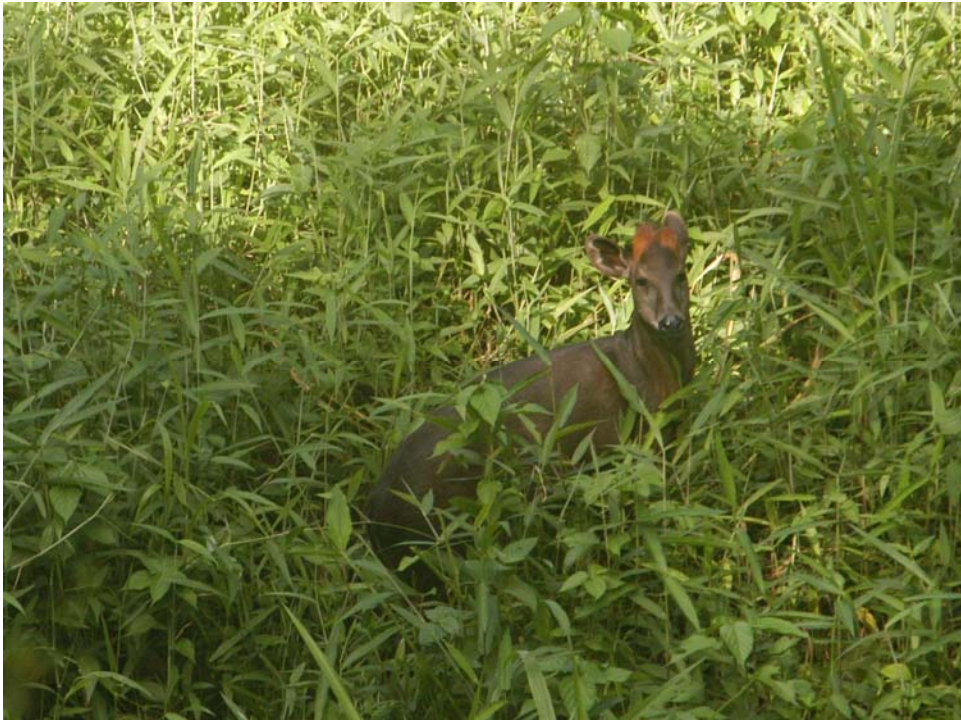
Figure 12. The Endangered Abbott's duiker Cephalophus spadix ; only hand photo existing.

confirmed over the last decade. The Critically Endangered Aders' duiker Cephalophus adersi , another small ungulate, is confined to Zanzibar coral rag thickets (Finnie, 2002) and coastal forest in Arabuko-Sokoke and Boni and Dodori, Kenya. The latter population was only recently discovered (Andanje et al. , 2011) and while the population is sizeable, habitat degradation and unsustainable hunting remain severe threats (as on Zanzibar). Finally, in a survey of the poorly explored Boni and Dodori National Reserves, northeastern Kenya, Mwinami et al. (2013) reported the presence of the Vulnerable Haggard's oribi Ourebia ourebi subsp. haggardi in cultivated areas near Mangai. The Vulnerable common hippopotamus Hippopotamus amphibius and the Near Threatened coastal topi Damaliscus lunatus (Burchell, 1824) subsp. topi Blaine, 1914 were other notable records from this region (Mwinami et al. , 2013).