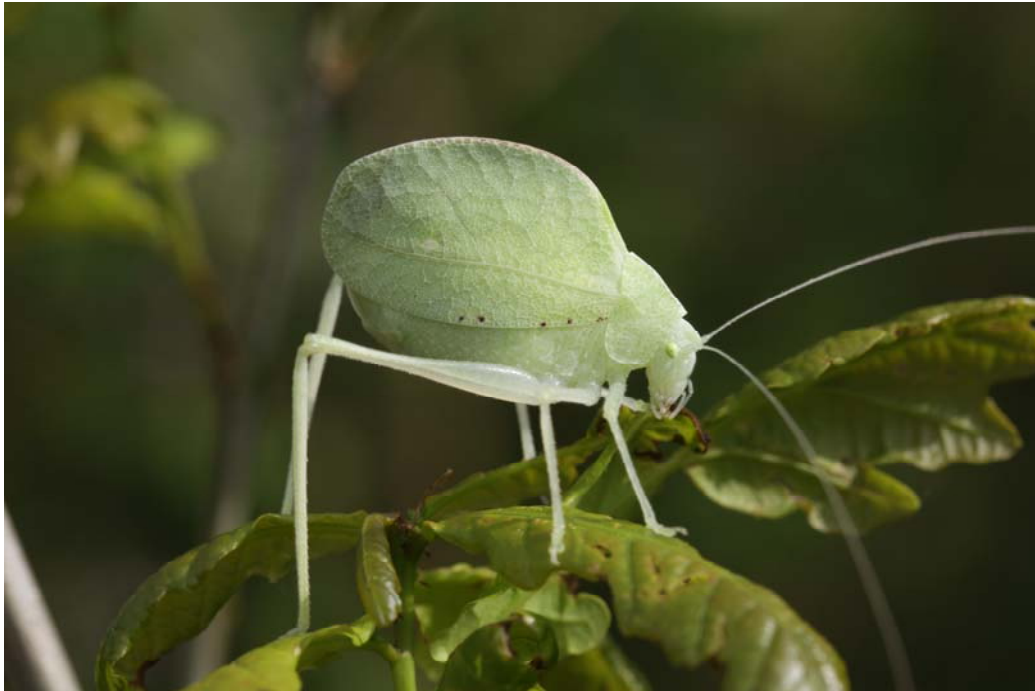
Figure 9. The giant ridgeback Tropidonotacris grandis (here a female) was known only from the male holotype coming from Little Mahenge until recently it was collected in deciduous dry forest on the eastern slopes of Mount Kilimanjaro and the southern slopes of the North Pare Mountains.

(Hemp et al. , 2014b, 2015), including the Vulnerable great ridgeback Tropidonotacris grandis Ragge, 1957 (figure 9) and the Endangered inflated tree bushcricket Euryastes jagoi Ragge, 1980 (figure 11), both of subfamily Phaneropterinae. Two species of subfamily Conocephalinae tribe Angraeciini from the small Lutindi Forest in the West Usambara Mountains (Hemp et al. , 2014a, 2015) are assessed as Critically Endangered, as is one species of Phaneropterinae, the Taita plump bushcricket Peronura hildebrandtiana Karsch, 1899 (Hemp, 2011; figure 10) from the forest remains of the Taita Hills. The majority of the proposed threatened Ensifera taxa come from the East and West Usambara Mountains and the North and South Pare Mountains. Several other taxa occur in the forest reserves of the Taita Hills, Nguru and Uluguru Mountains. In addition to these Ensifera, nine species of Orthoptera suborder Caelifera superfamily Acridoidea will also be listed in threatened categories.