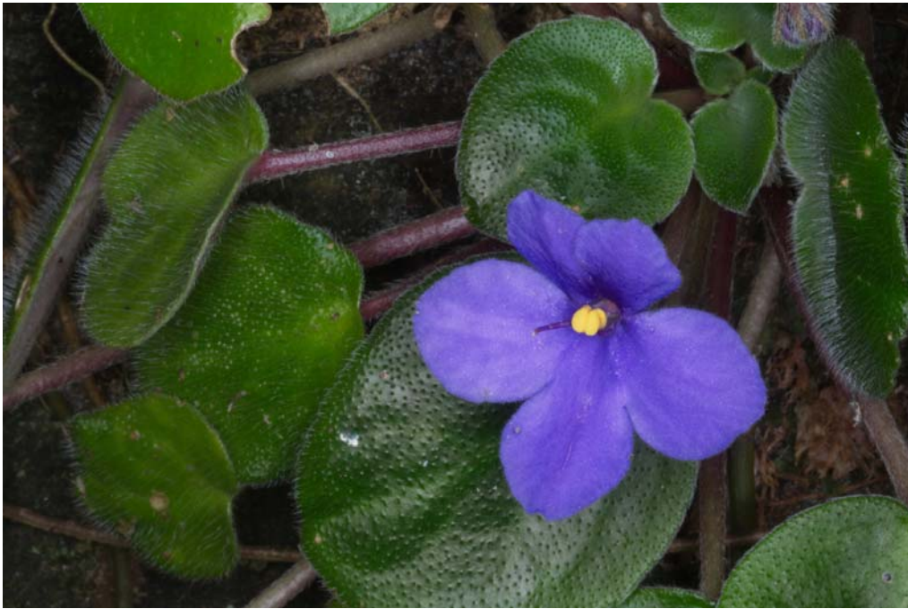
Figure 19. The Critically Endangered Saintpaulia teitensis .

as is the Near Threatened mvule (Swahili) Milicia excelsa (Welw.) C.C. Berg. The Near Threatened Brachylaena huillensis O. Hoffm. is among the tree species most preferred for charcoal, and its wood is also heavily exploited in the wood carving industries of Kenya and Tanzania (World Conservation Monitoring Centre, 1998). The dominant trees in Miombo woodland, species of Brachystegia and Julbernardia , are fire-sensitive at young age, and regular fire tends to decrease their number and thus alter the vegetation structure; Julbernardia globiflora (Benth.) Troupin is also among the species most preferred for charcoal. In Kilengwe Forest, a forest in Morogoro Rural District that is dominated by J. globiflora , many of these same species ( Khaya anthotheca , Dalbergia melanoxylon , Milicia excelsa ) are logged below their minimum required harvestable diameter (Kacholi, 2014).