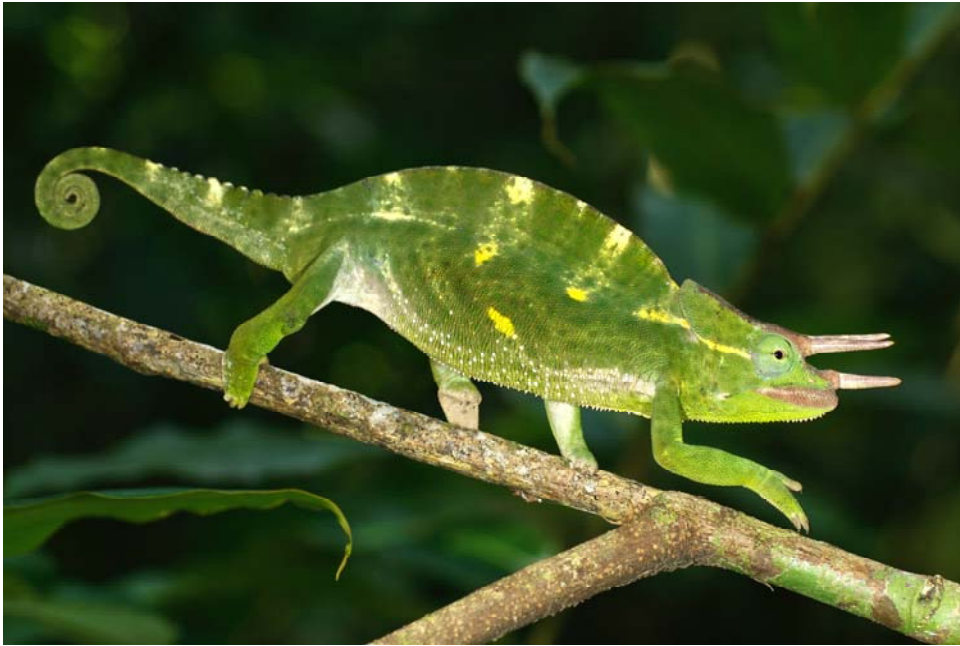
Figure 15. Trioceros deremensis .