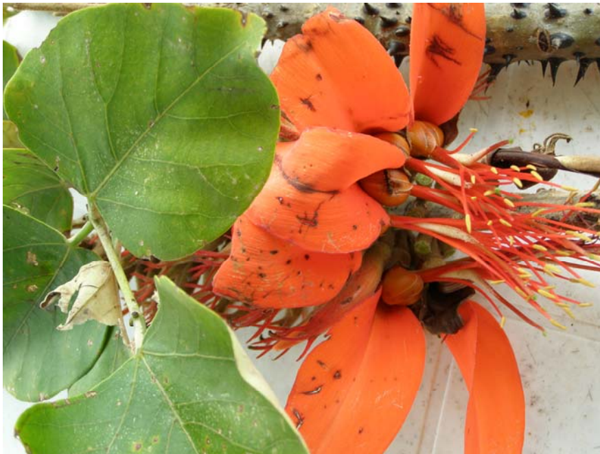
Figure 18. The Critically Endangered Erythrina schliebenii , leaf and flowers.