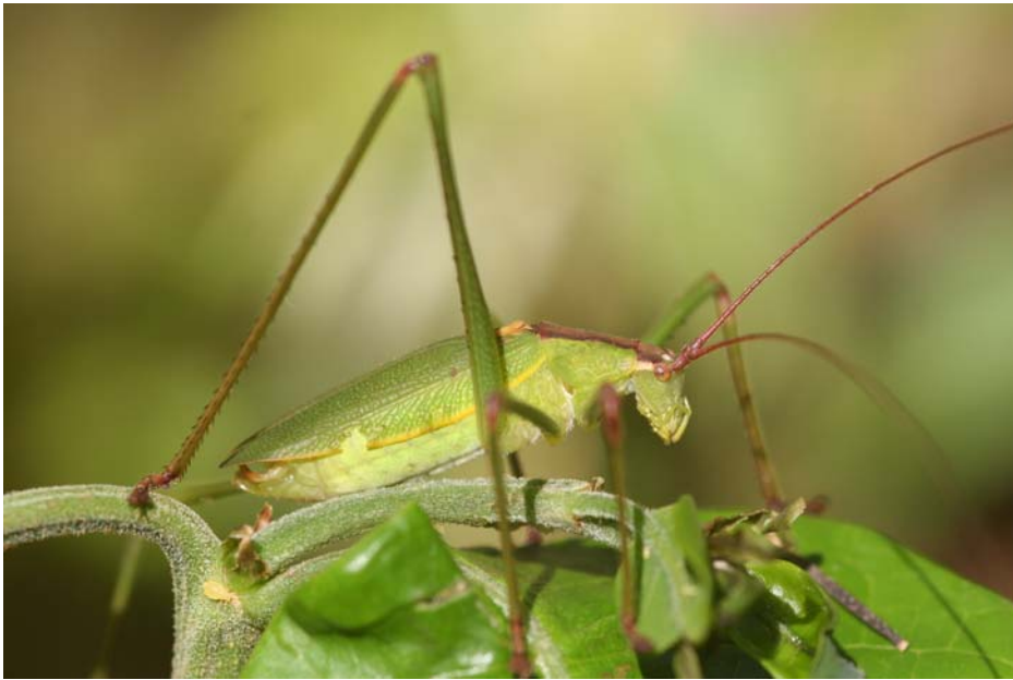
Figure 10. The Taita plump bushcricket Peronura hildebrandtiana (here a male) was described based on a single female and rediscovered in 2011 along forest edges at montane elevations in the Taita Hills.