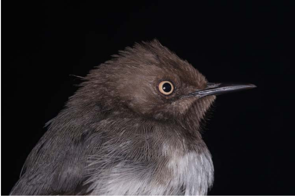
Figure 6. The Critically Endangered Taita apalis Apalis fuscigularis .

et al. (2014b) conducted playback surveys that have slightly expanded the known range of the species with previously unreported subpopulations in various small forest fragments in Taita Hills (Msidunyi, Yale, and Mbololo) and a reconfirmed old record in Fururu. However, these range extensions and rediscovery have added fewer than 15 pairs to the total population, and monitoring of the three main subpopulations at Ngangao, Vuria, and Chawia forest fragments shows a steady decline in range and numbers.