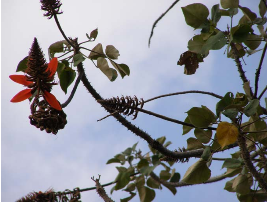
Figure 17. The Critically Endangered Erythrina schliebenii , branches with foliage, flowers, and fruits.