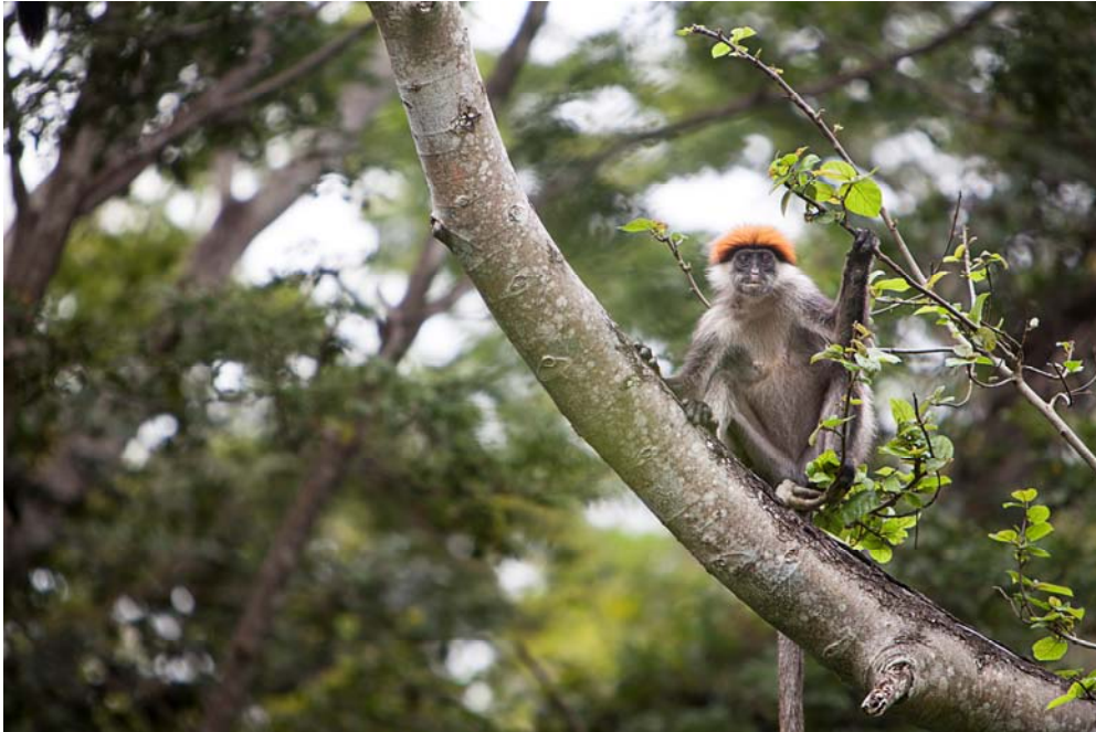
Figure 13. The Endangered Udzungwa red colobus Procolobus gordonorum .

preferring lowland to medium-elevation forest zones makes them especially at risk in the near future due to fast-increasing agricultural intensification in the Kilombero Valley.