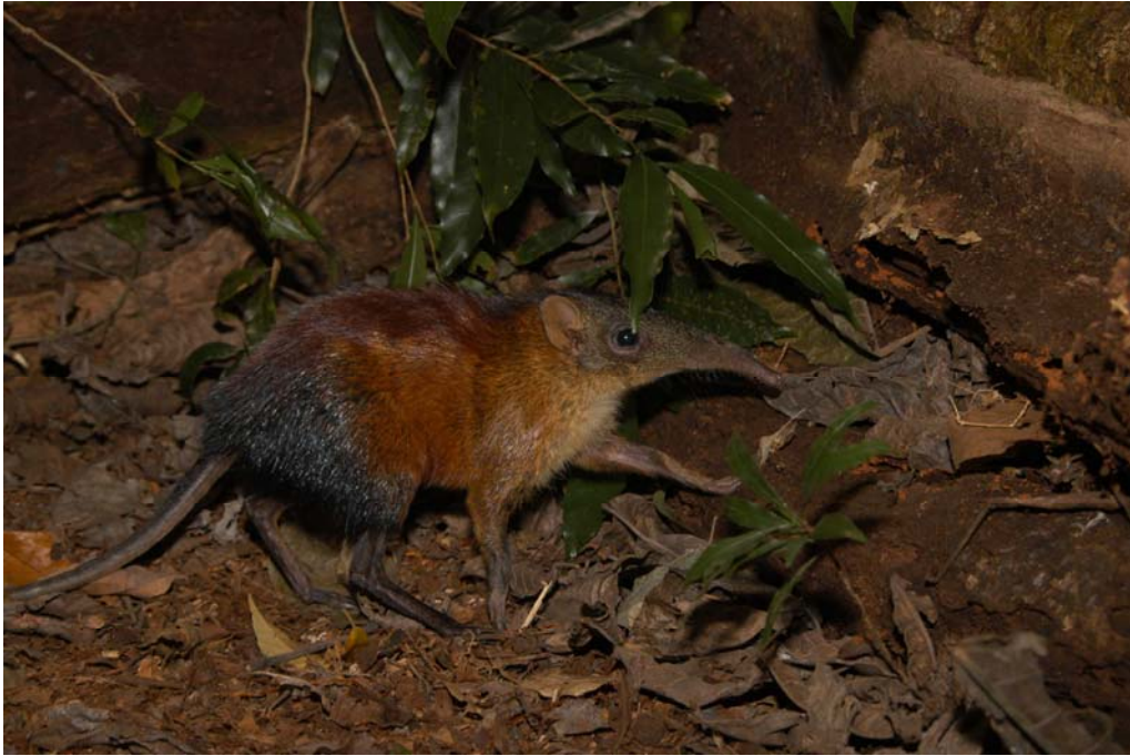
Figure 14. The Vulnerable grey-faced sengi Rhynchocyon udzungwensis .