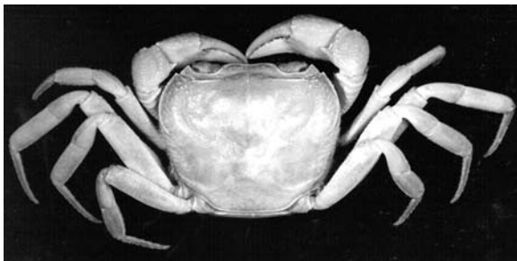
Fig. 1 Habitus

l Total—29 genera with various overlapping distributions (see above for details)