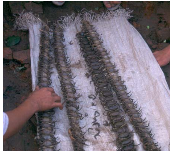
Fig. 4 Freshwater crabs ( Somanniathelphusa dangi : Parathelphusidae) being sold as food in a rural market in northern Vietnam

One of the key processes driving freshwater crab diversification is likely to be allopatric speciation resulting from geographic isolation. This is helped by the relatively low fecundity and poor dispersal abilities of freshwater crabs; and is often facilitated by the habitat heterogeneity and numerous ecological niches and microhabitats afforded by the complicated topography and hydrology of their