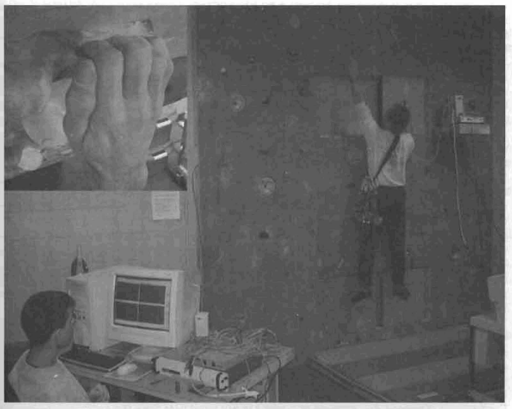
Figure 1 Subject performing the high-step rock-on climbing move with 4.5 kg added weight, inset illustrates hand position.

Statistical treatment of the data was performed using a Two-Way (trial by weighted condition) Repeated Measures ANOVA for peak vertical ground reaction force, peak integrated EMG, peak ground reaction force at Peak EMG, and EMG at peak vertical ground reaction force. A Mixed Factors Three Way ANOVA (Repeated factors of trial by weighted condition and independent measure of when peak was measured) was also performed.