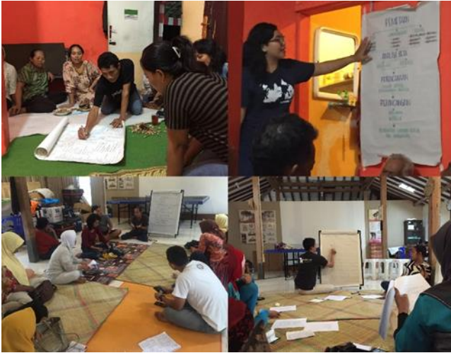
Fig 3. Community meetings (Author, 2016)

The linking of social capital in Kalijawi project was started by presenting their actions to the local government and demanding community-based planning for the future plan of Yogyakarta in 2014. In order to create comprehensive changes in perceiving informal settlement upgrading, ArkomJogja and Paguyuban Kalijawi is not only yielding their right through a protest like what others organization do, but they also showed projects and actions that have been done, and more importantly, they presented their capability in term of managing their environment by set of participatory tools like mapping, planning, and organizing. They also initiated a saving group mechanism to the authority and proofed that they could make a change event without government funds. Although not yet accepted as an official approach by the authority but community based participatory upgrading will continue its guerilla, making urban rationality that is continuously rebuilt, renegotiated, and reframed