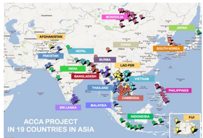
Fig 1. ACCA projects (CAN, 2011)

Based on actual case of Kampung Kali Code and the spirit of gotong royong , in the late 2010, ArkomJogja (Community Architect in Yogyakarta) was initiated by some community architects and social workers to find solutions regarding to informal settlement issues (Fitrianto, 2014). They believe that residents should take their own roles in undertaking their problems and challenging their right to the city. A momentum of transformation was in line to the shared initiatives with the ongoing program from ACCA (Asian Coalition for Community Action), a program that was initiated by CAN (Community Architecture Network). Furthermore, this program is also a part of the main organization in the wider context called ACHR (Asian Coalition for Housing Rights) that by now operating in 19 countries, and creating a network with a lot of organizations, communities, academic institutions, and professionals (Boano, 2014).