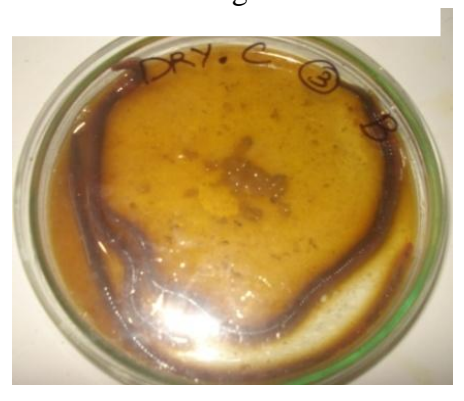
Fig 4 : Anthelmentic activity of CM extract in Eisenia foetida at 500mg