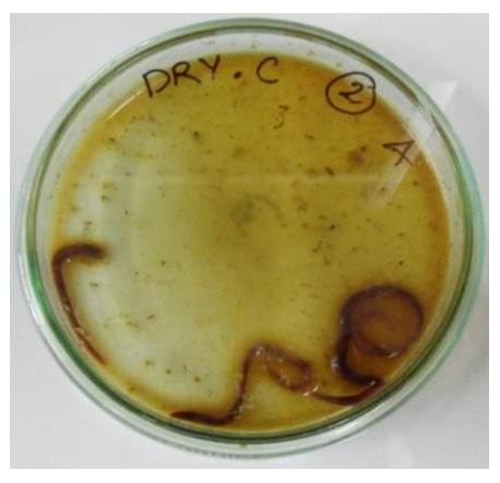
Fig 3: Anthelmentic activity of CM extract in Eisenia eugeniae at 500mg