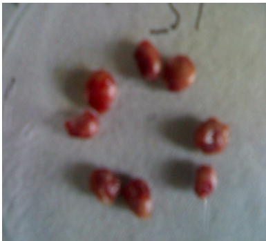
Test compound (1 a )