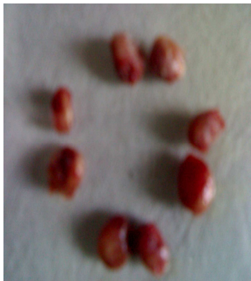
Test compound (1 c )