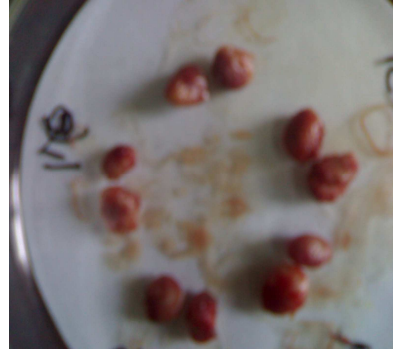
Test compound (1 b )