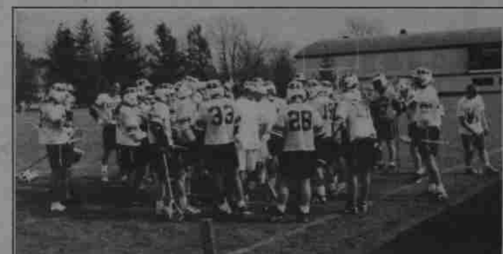
The Lords take a time out against Denison.

The Big Red of Denison came out ready, scoring two goals in as many minutes. Their superior team quickness and tremendous offensive coordination had the Lords