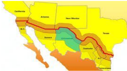
Figure 2. Boundary of the state of Sonora, Mexico with the United States

In order to validate the proposed model, a survey was carried out on 116 SMEs in the information technology and metalworking sectors in Sonora. The state of Sonora is in the northwest of the country and is the second largest state in Mexico, representing 9.2% of the total land area; it shares borders with the United States including the states of Arizona and New Mexico. Figure 2.