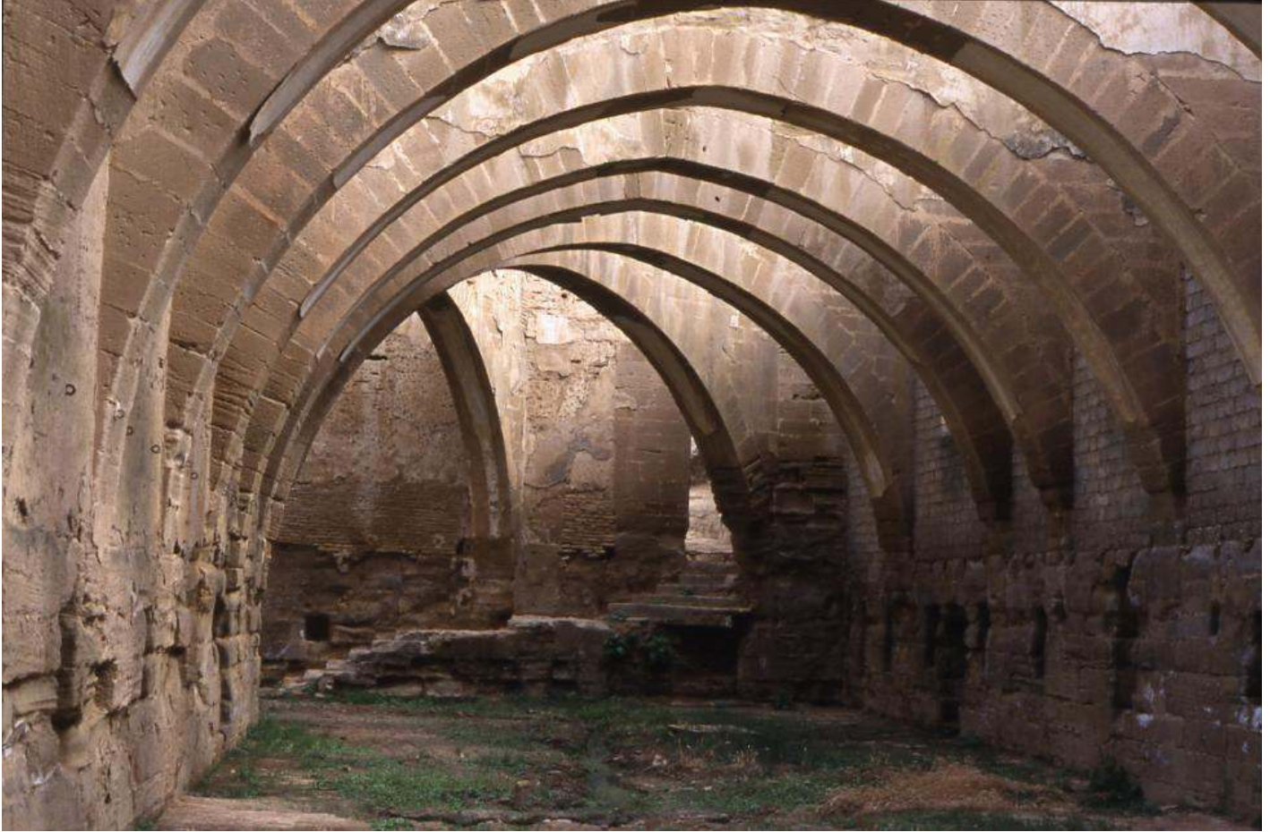
Figure 4. Dormitory, Santa María la Real de Sigena