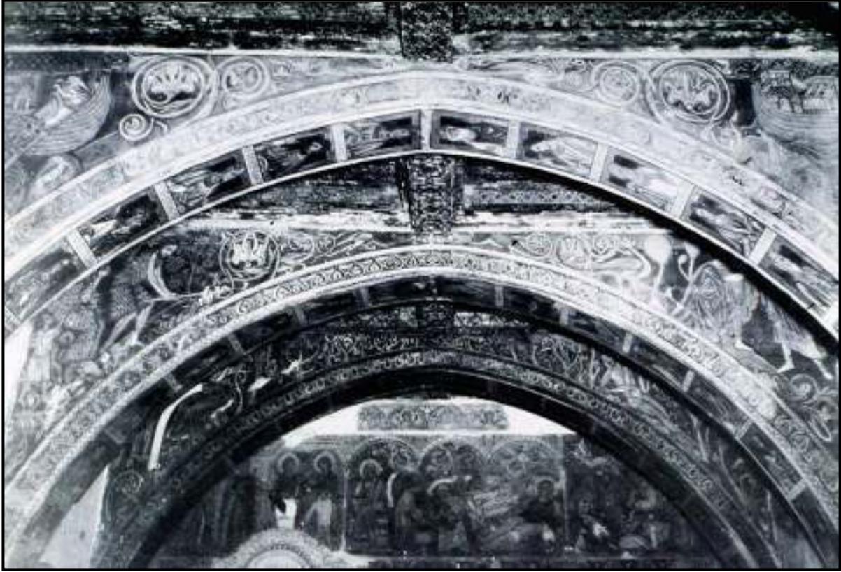
Figure 7. Chapterhouse frescos, Santa María la Real de Sigena (After: Josep de Gudiol, published in Walter F. Oakeshott. Sigena: Romanesque Painting in Spain and the Winchester Bible Artists . London, 1972)

extends then to the walls and rises from the base of the diaphragm arches to the artesonado ceiling. Because the walls were whitewashed over time due to changing styles and water damage, several gaps in the program are irretrievable, although the consistency of the program presents some logical choices within the established Christological plan. 37 ( fig. 10 )