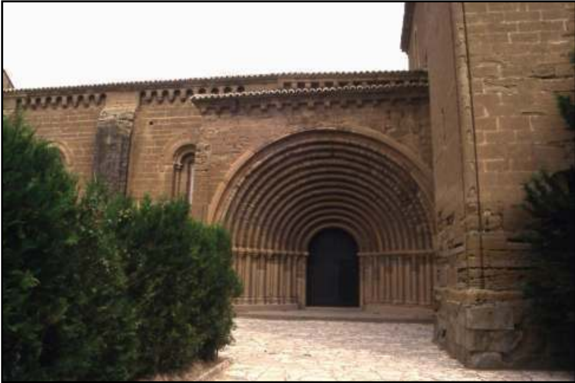
Figure 1. Santa María la Real de Sigena

examining the disparate stylistic choices made at Sigena by the queen and her advisors, I will show that this building project presented a radically different approach to monastic