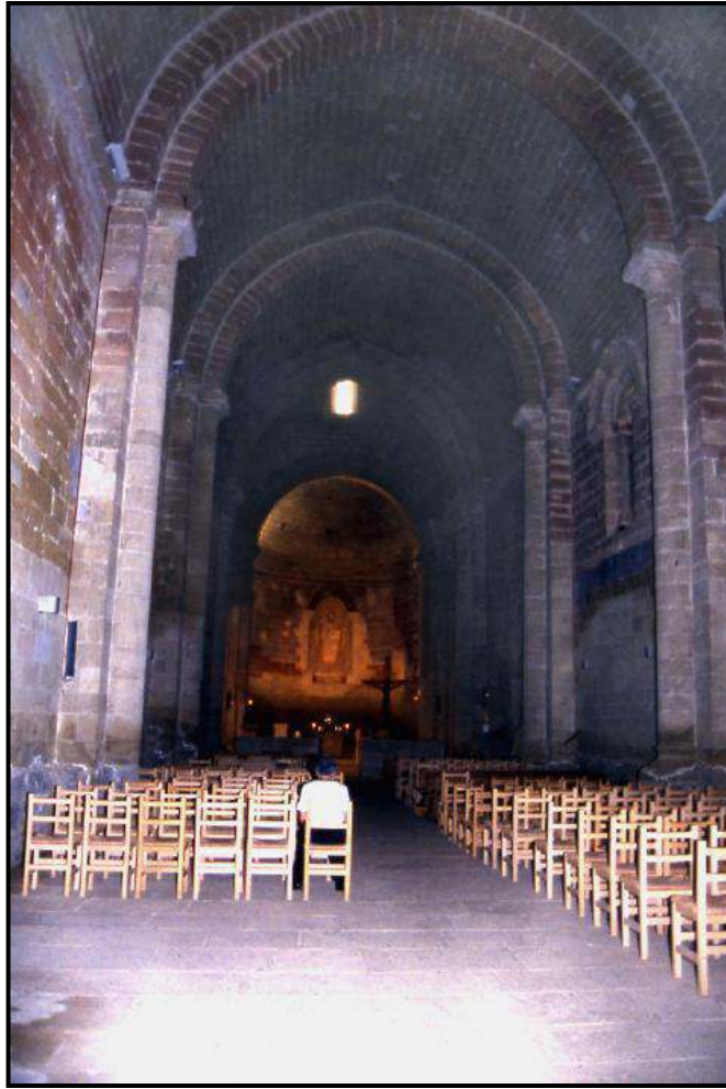
Figure 3. Nave, Santa María la Real de Sigüenza

proper or the primary audience halls of palaces. For these spaces, either barrel vaults or ribbed vaults continued to dominate. These fully vaulted structures are more stable, but require more stone and labor. The diaphragm construction allowed for transverse arches to create a frame that could be covered with lighter materials, generally wooden beams. At Sigüenza these arches allowed for less-expensive vaulting, quicker construction, and space for embellishment.