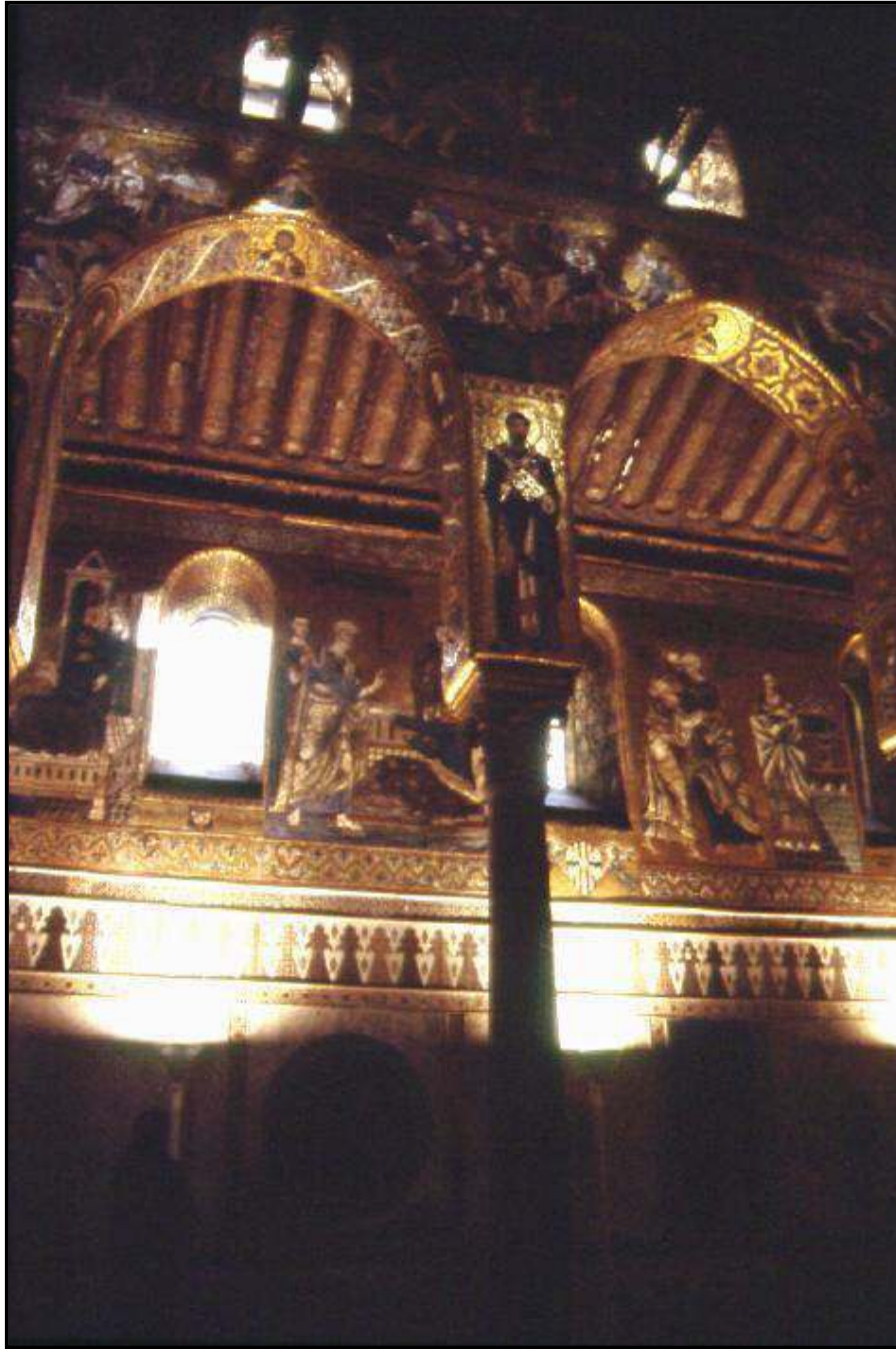
Figure 12. View of the side aisle of the Cappella Palatina, Palermo