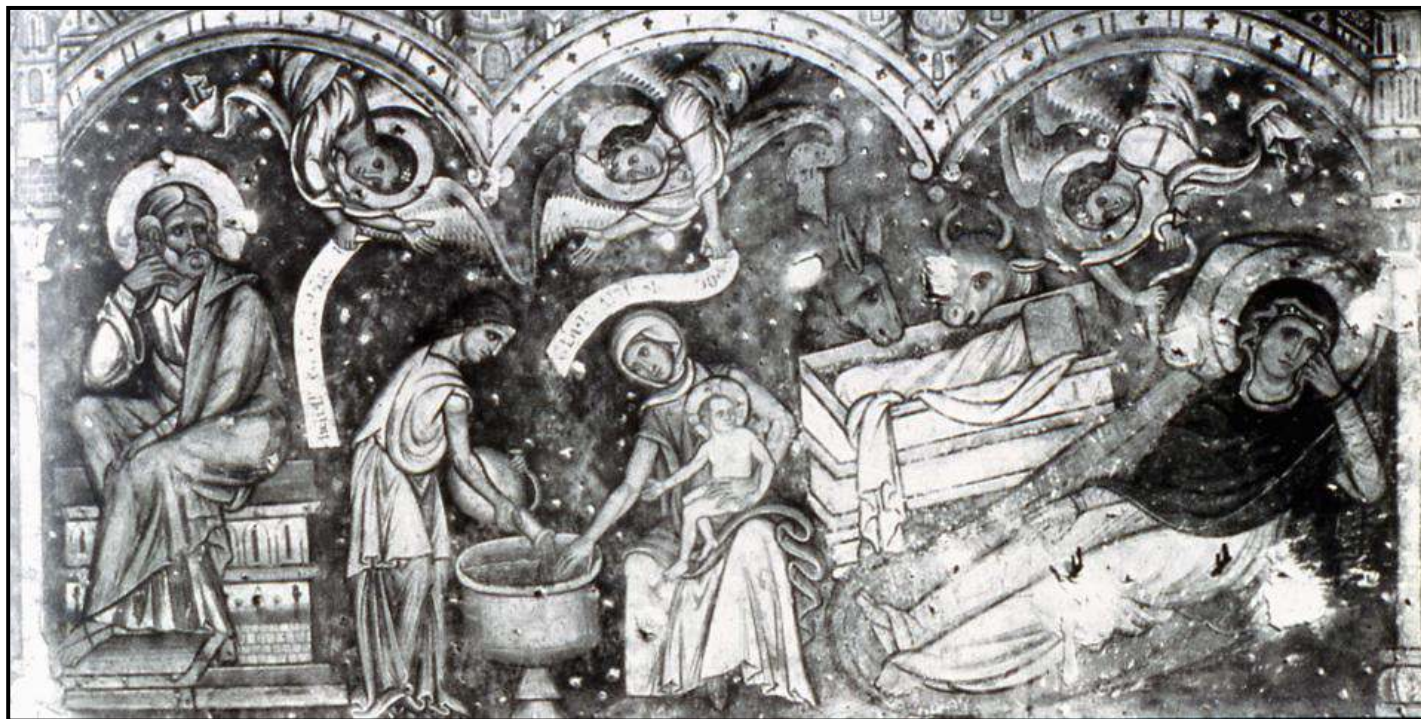
Figure 10. Nativity, south wall, Chapterhouse, Santa María la Real de Sigena (After: Josep de Gudiol, published in Walter F. Oakeshott. Sigena: Romanesque Painting in Spain and the Winchester Bible Artists . London, 1972)

linear but with enough volume and contrast of light and dark to suggest a level of naturalism. The softened lines create a level of dynamism to the figures. Unfortunately, due to the fire in 1936, the color of the narrative panels does not survive