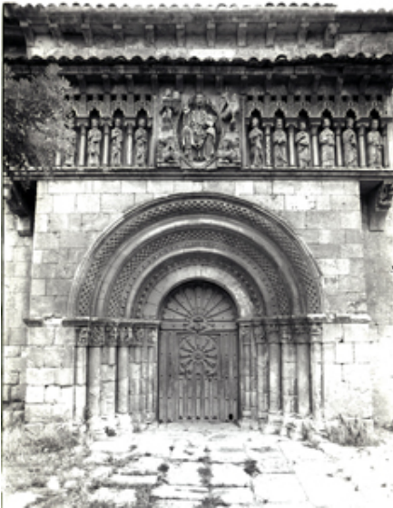
General front view of the facade at Moarves de Ojeda. Province of Palencia, Spain. (1973)