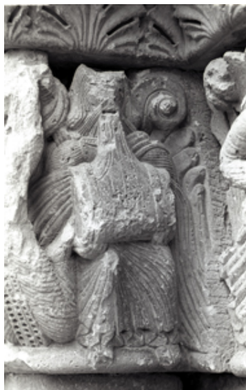
Left group; musician with instrument unknown to me. Located around a corner between the capitals I have identified as 4th and 5th from the left. Moarves de Ojeda, Province of Palencia, Spain. (1973)