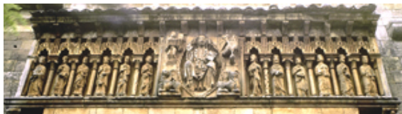
Previous image cropped to Christ and the apostles only. Moarves de Ojeda, Province of Palencia, Spain. (1973)