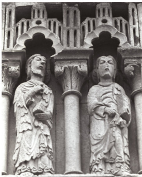
Two of the apostles. Moarves de Ojeda, Province of Palencia, Spain. (1973)