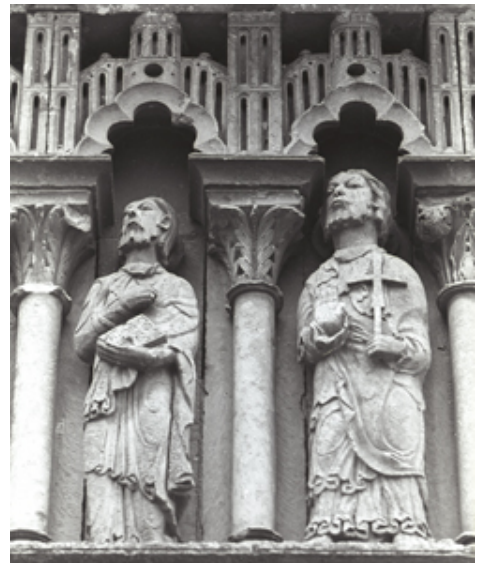
Two of the apostles. Moarves de Ojeda, Province of Palencia, Spain. (1973)