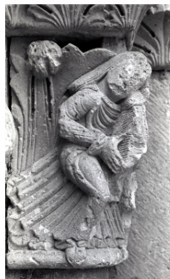
Left group; 5th from the left. Musician with harp. Moarves de Ojeda, Province of Palencia, Spain. (1973)