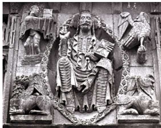
Christ and symbols of the evangelists. Moarves de Ojeda, Province of Palencia, Spain. (1973)