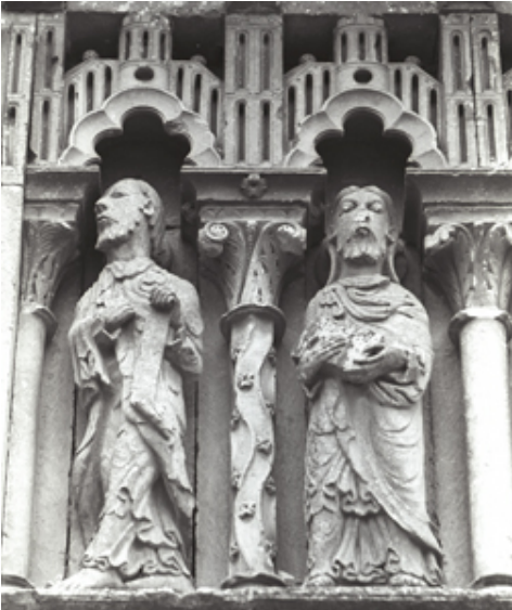
Two of the apostles. Moarves de Ojeda, Province of Palencia, Spain. (1973)