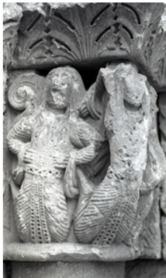
Left group; 4th from the left. Two dancers. Moarves de Ojeda, Province of Palencia, Spain. (1973)