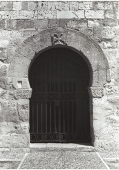
Doorway. Baños de Cerrato, Provincia de Palencia, Spain. (1973)