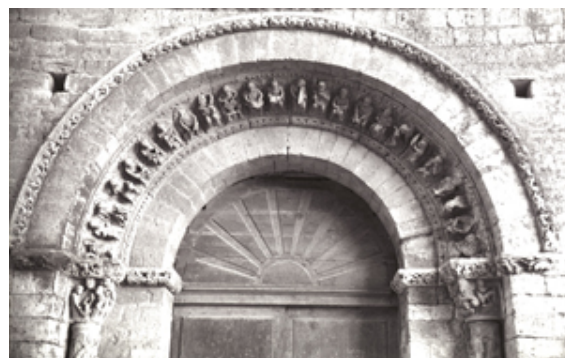
Archivolt. Church of Santiago, Carrion de los Condes, Spain. (1984)