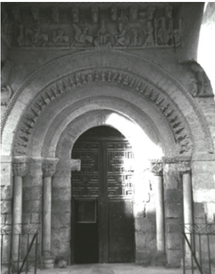
Closer frontal view of the doorway. Santa María del Camino, Carrion de los Condes, Spain. (1984)