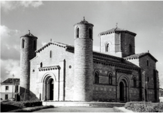
General view of the church at Fromísta. (1966)