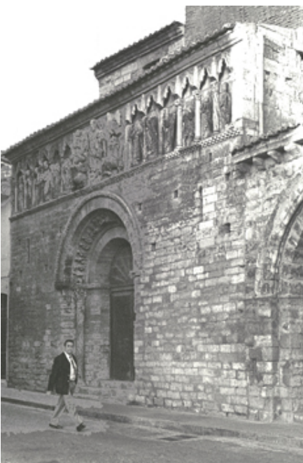
Facade of the Church of Santiago. Carrón de los Condes, Spain. (1984)