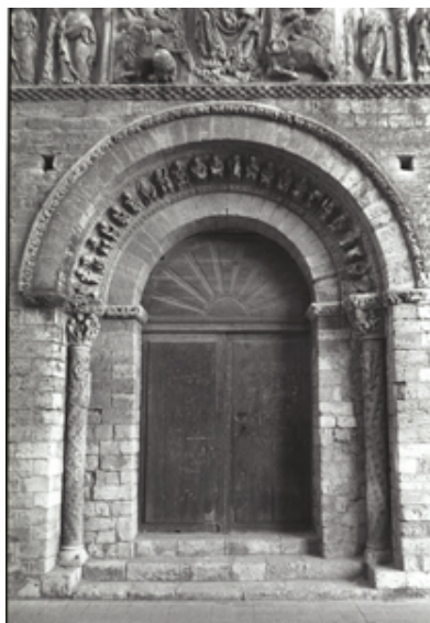
Doorway with capitals and archivolt. Church of Santiago, Carrion de los Condes, Spain. (1984)