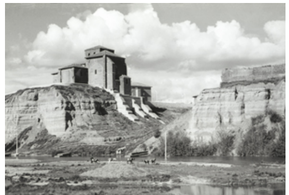
General view of the approach to the town. Carrón de los Condes, Spain. (1966)

This town has two churches that were important on the road to Santiago de Compostela: Santiago, built ca. 1165, and Santa María del Camino, also of the 12th century. Santiago has retained only the facade, while Sta. Ma. may be complete.