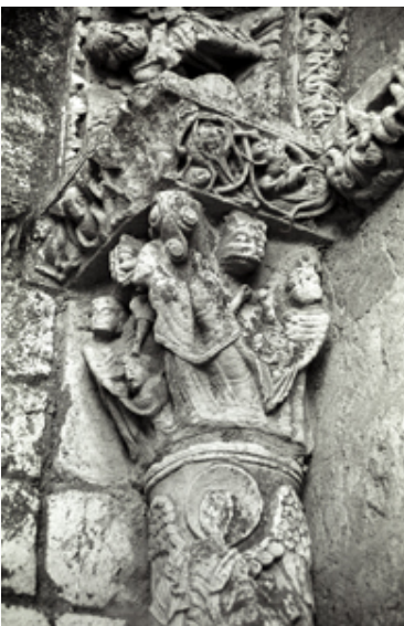
Capital at the base of the archivolt. Church of Santiago, Carrion de los Condes, Spain. (1984)