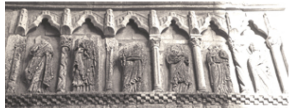
Download image as .tif