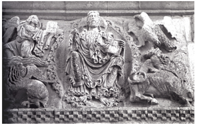
Download image as .tif