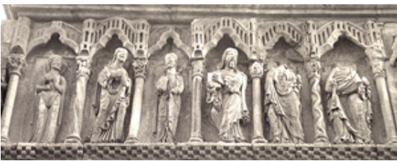
Apostles to Christ's right. Church of Santiago, Carrion de los Condes, Spain. (1984)