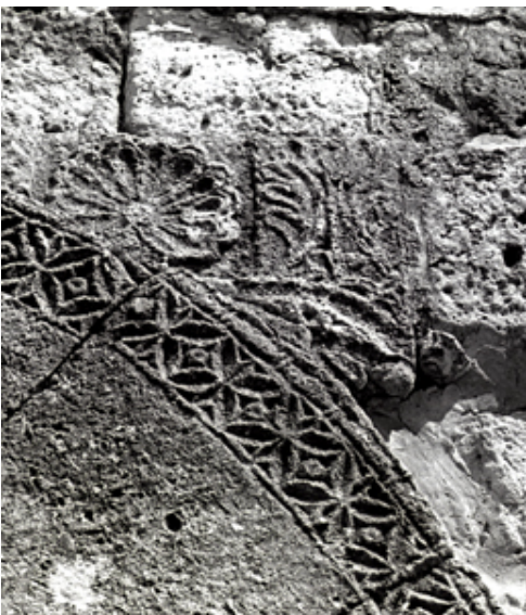
Ornament to the right near the top of the doorway arch. Baños de Cerrato, Provincia de Palencia, Spain. (1973)