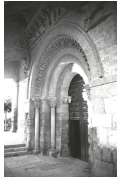
Angle view of the porch and doorway. Santa María del Camino, Carrion de los Condes, Spain. (1984)