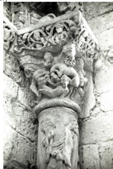
Capital at the other base of the archivolt. Church of Santiago, Carrion de los Condes, Spain. (1984)