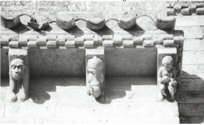
Detail of three of the modillions from the previous image. (1966)