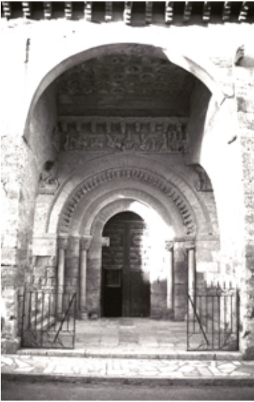
Porch of Santa María del Camino. Carrion de los Condes, Spain. (1984)