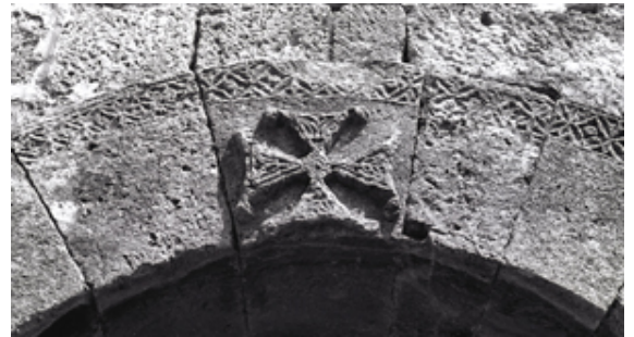
Top of the doorway arch. Baños de Cerrato, Provincia de Palencia, Spain. (1973)