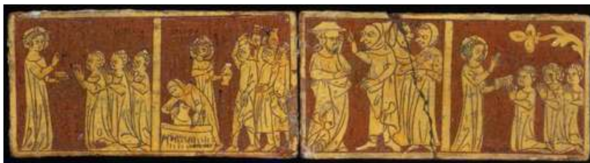
Tring Tile: Fig. 10A, Jesus and kneeling boys. Fig. 10B, Jesus and boys at well First quarter, 14 th century, England.

children, the importance of Jesus' life-saving power, even though following his lead can be difficult. The repetition of this image of kneeling children suggests a special emphasis on conversion, possibly of children. However, the tile images of the children brought back to life is also a reminder of the "convert or die" threat often faced by Jews, as they infer successful attempts by the Christian English to convert the Jews. In reality, the attempted conversion failed after a two-century effort which ended in the expulsion of 1290.