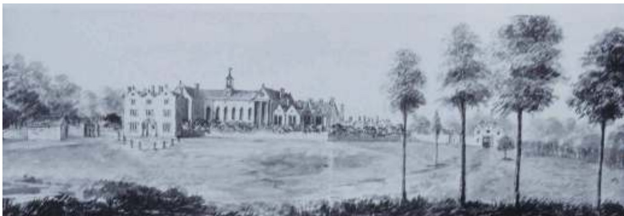
Fig. 16. Ashridge College in early 18 th century. Gough Maps II, fol. 62r.

many miracles. 86 The remaining 2/3 of the blood from the phial was reserved for the chapel of St. Mary at Ashridge College. (figs. 16 & 17)