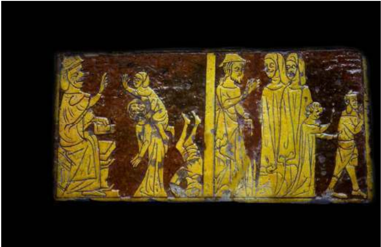
Tring Tile: Fig. 2A, Zacharias, boy and Jesus; dead boy. Fig. 2B, Joseph and parents; Jesus reviving boy.

including such insults as “child-killer” and “wanton.” 34 It is important to remember that it was a Christian author who put these words into the Jews’ mouths, an action which, in Christian minds, reflects negatively on the part of the Jews, more than on Jesus.