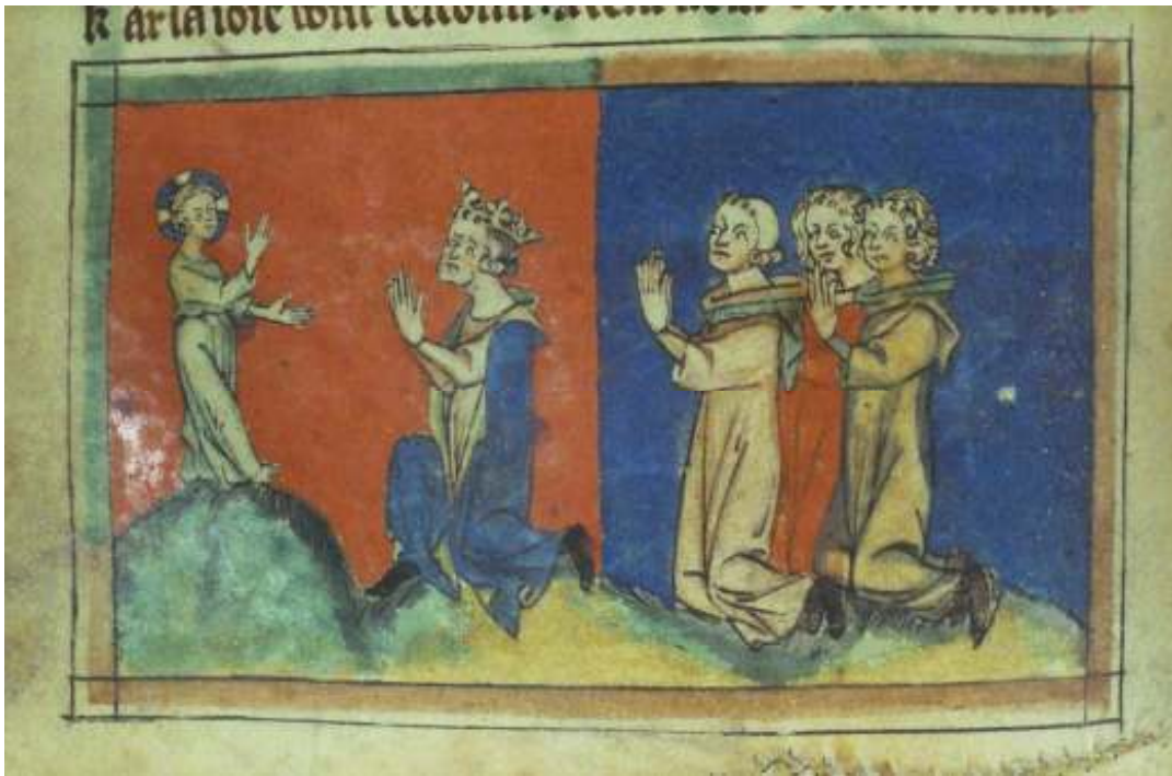
Fig. 12. Selden Supra 38, fol.8v. Jesus and Frondise with his followers. c. 1325, England.

country that had seen few Jews since their expulsion from England in 1290. The Selden Supra 38 manuscript ( fig. 12 ) had especially pandered to this bias as its text is considerably more antisemitic than the ancient manuscripts from which it was derived, specifically the Gospels of Thomas and Pseudo-Matthew. 13 As Selden Supra 38 magnifies the rhetoric praising Christ, it also amplifies the virulent pronouncements which curse and damn the Jews. Such harsh dialogue provides a shadowy explanation for the caricatured, exaggerated faces of the Jews with whom Jesus clashes in the Tring Tiles . 14