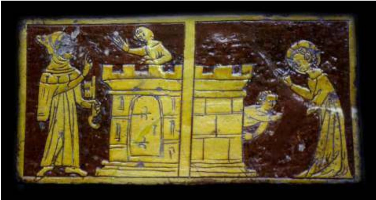
Tring Tile: Fig. 8A, Father locks son in tower. Fig. 8B, Jesus pulls boy from tower. First quarter, 14 th century, England.

The castle tower was an important feature of medieval Anglo-Jewish life. 72 Unless they were given permission by the king to do otherwise, Jews were required to live in a town with a royal castle, where Jewish business affairs with Christians were managed and the document chests, the archae , were kept. The tower was also a place of refuge when Jews were threatened by angry, murderous Christians. Conversely, towers, especially the Tower of London, were used to imprison and execute the Jews. At times, Jews saved their lives by converting while they were imprisoned