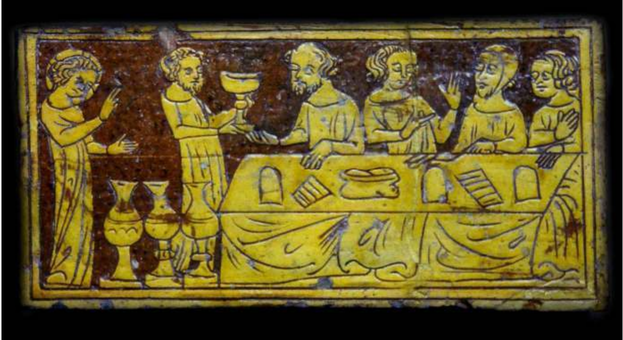
Tring Tile: Fig. 15, Jesus changes water to wine at the wedding of Architeclin. First quarter, 14 th century, England.

miraculous episode which encapsulates the Christian symbolism associated with Christ's death, and particularly, his shedding of blood and the ritual of the Eucharist.