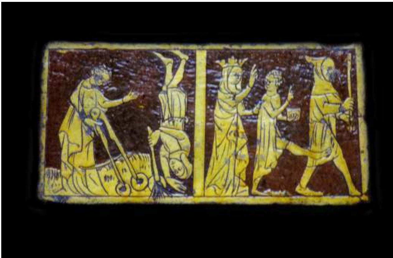
Tring Tile: Fig. 1A, Jesus building pools; dead boy. Fig. 1B, Mary, Jesus reviving dead boy. First quarter, 14 th century, England.

While the sweet face of the Child Jesus as drawn on the Tring Tiles may belie the strangeness of his actions, it clearly reflects the resurgence in the thirteenth and fourteenth centuries of Christianity's focus on the humanity of Christ and the desire on the part of the Christian faithful to know more about his childhood years. In addition, the stories, sometimes not so subtly, reflect the conflicts that existed between Jews and Christians in the early years of the