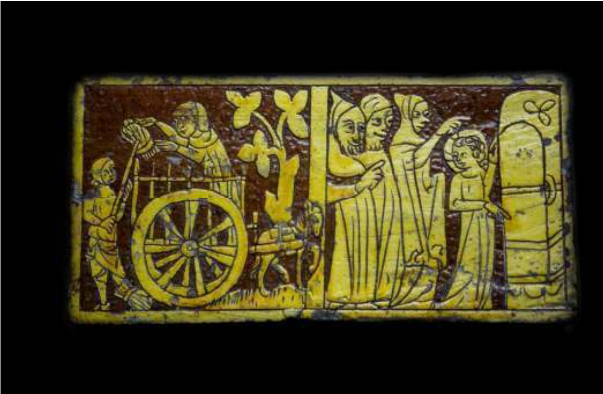
Tring Tile: Fig. 9A, Harvesting Jesus' wheat. Fig. 9B, Fathers and Jesus at oven. First quarter, 14 th century, England.

obviously, the lost model for the Tring Tiles . Infancy scholars have suggested that the Gospels were originally written in Syriac and translated into Arabic before the fifth-sixth centuries, providing Muslims, including Muhammad, access to the stories, resulting in the Prophet's inclusion of some of the Infancy material in the Quran. 76 Conversely, another scholar suggests that the story originally took form in the seventh century Arabic gospels. 77