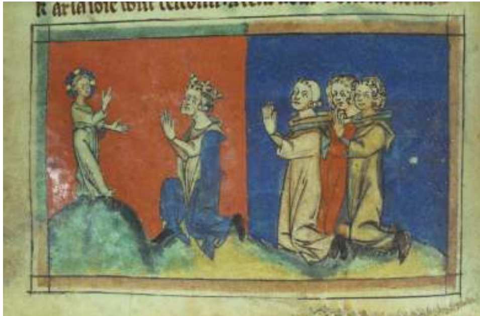
Fig. 12. Selden Supra 38, fol.8v. Jesus and Frondise with his followers. c. 1325, England.

Gospels, when two teachers kneel to adore Jesus. (fig. 14) In all these cases, the text reveals that blessing and conversion is taking place, indicating the triumph of Jesus and therefore Christianity. 82