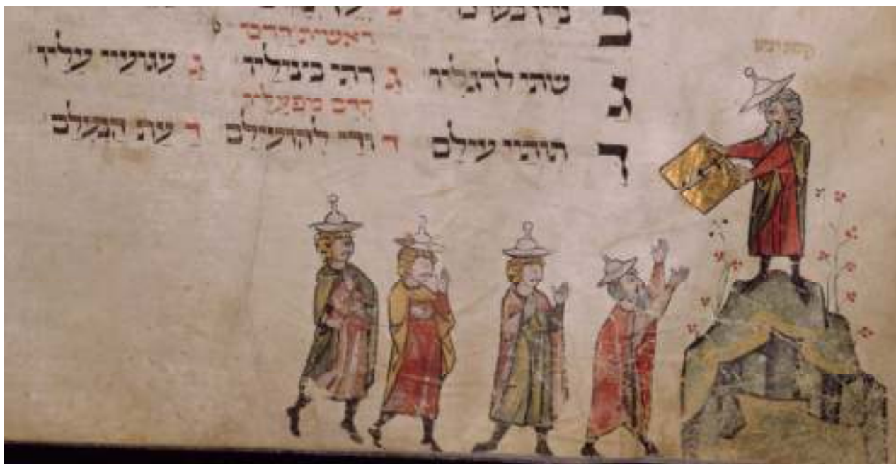
Fig. 4B. Leipzig Mahzor, Moses handing down the tablets Leipzig. Universitätsbibliothek, Hebrew Ms. Vollers 1102, vol. I. fol. 130B

Examination of this ritual clarifies the encounters between Jesus and the teachers in the apocryphal Infancy Gospels and on the Tring Tiles . Comparison between the description of the Jewish ritual and the episode in the apocryphal texts reveals that the Tring Tile teachers are not merely attempting to instruct Jesus in the A B C's, but are introducing him to this historic Jewish ritual designed to teach the boy to love the study of the Torah. In addition, the ritual represented the child's rite-of-passage into the male, adult world of his culture. The teaching exercises also used verses and rhymes to enhance the child's memory and to incorporate instruction in moral behavior. 45