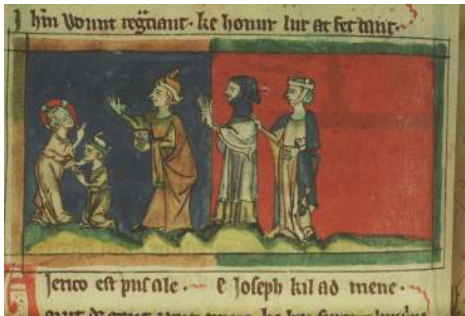
Fig. 13. Selden Supra 38, fol. 20v, Jesus and kneeling boys; parents. C 1325, England.