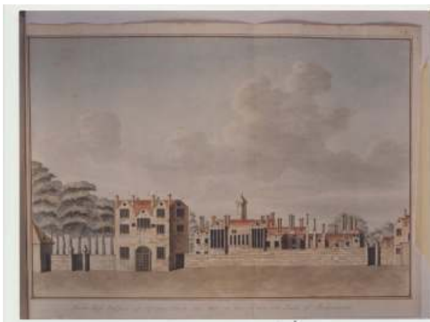
Fig. 17. Ashridge College in 1761.