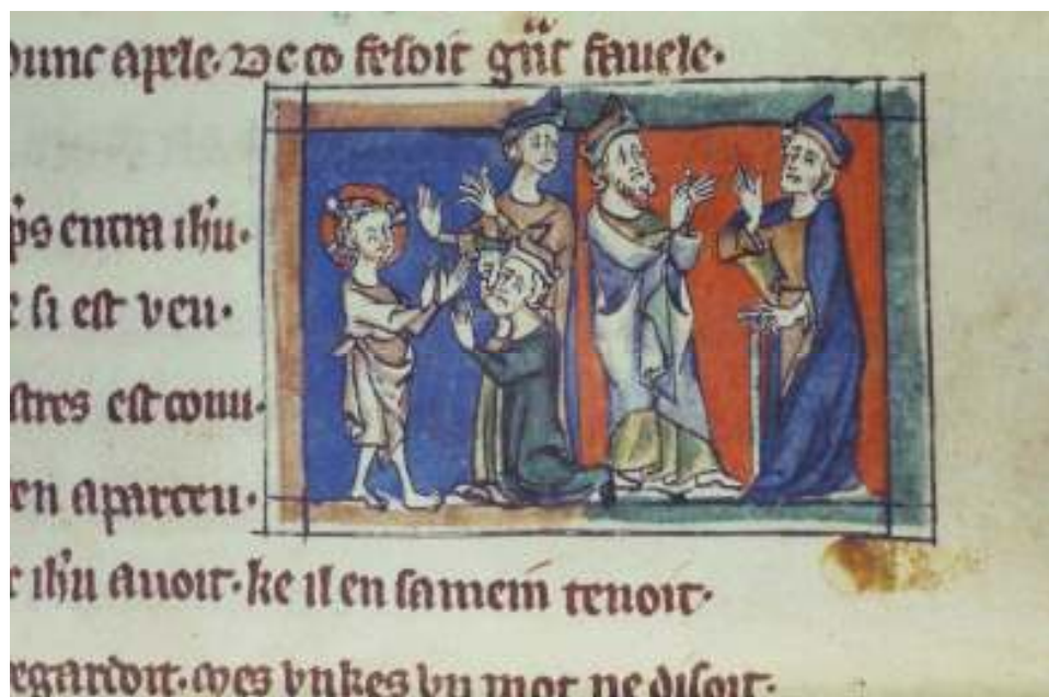
Fig. 14. Selden Supra 38, fol. 30r, Jesus and kneeling teachers; Joseph and teacher. c. 1325, England.