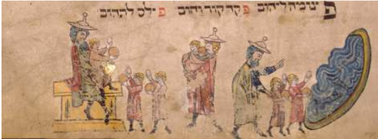
Fig.4A. Leipzig Mahzor, father with boy; teacher with boys Leipzig. Universitätsbibliothek, Hebrew Ms. Vollers 1102, vol. I. fol. 131A

Classical period, but by the twelfth and thirteenth centuries it had evolved into the form practiced by Ashkenazi Jews. The ritual's existence at this time was partially in response to the recently established Christian practice of confirmation of six-year old children, but was also in rebuttal to the Christian belief and practice of the sacrifice of the Christ Child in the Eucharist. 44