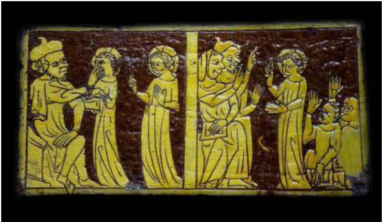
Tring Tile: Fig. 3A, Levi slaps Jesus; Jesus scolding. Fig. 3B, Teachers, Jesus; lame persons. First quarter, 14 th century, England.

In this image, Joseph's hat relates a puzzling message, as do Jewish men's hats in general, because they do not convey consistent meanings. In both Christian and Hebrew art, the headgear most frequently employed to depict medieval Jewish men was the pointed hat, termed the "upside-down funnel," seen with a variety of pointed, conical or rounded crowns. In addition, Joseph and other Jewish men are shown wearing various forms of the biretta and the coif. 35 Thus viewers must consider the context of the image in order to differentiate between the enemies of Christ and the respected Old Testament Patriarchs, whom Christians considered to be typological precursors