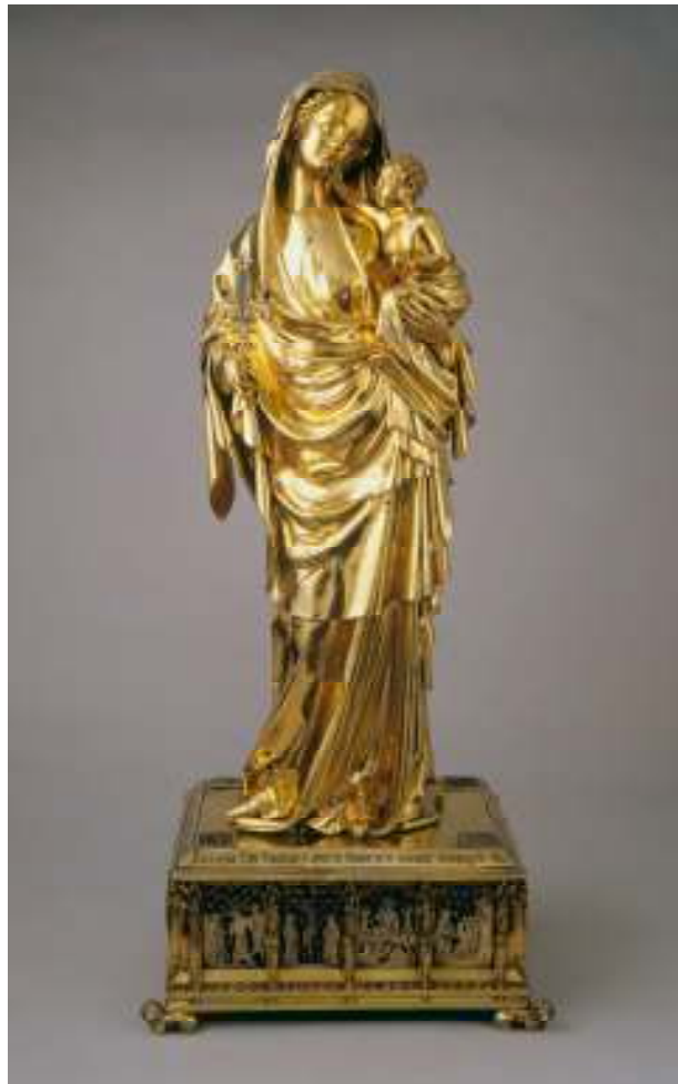
Fig. 7. Madonna and Child as Mater Amabilis. The Virgin of Jeanne d'Evreux. 1324-1339, Paris. Gilt silver, enamels, gold, pearls, granats, blue glass. Statuette, h: 68cm. Inv.: MR 419.

Sapientiae . The orb that the Christ Child holds has become the golden sweet round honey cake in the hands of the schoolboy and his classmates. However, these cakes also have a marked resemblance to the Christian Eucharistic Host, which again, in the context of this complex Hebrew ritual and the Infancy Gospels, brings forth memories of the Christian accusations of Host desecration against the Jews.