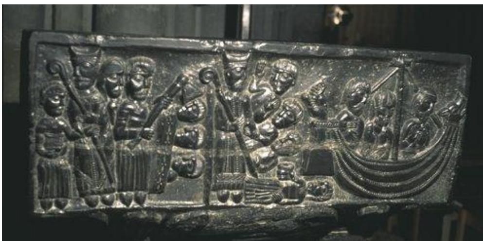
Figures 8, 9 Baptismal Font, Winchester Cathedral, Hampshire, c. 1129-1171.

typical Romanesque abstraction that emphasizes heads and hands over proportion, are depicted with assurance and clarity; St. Nicholas is repeatedly distinguishable by his ecclesiastical garb and his crozier.