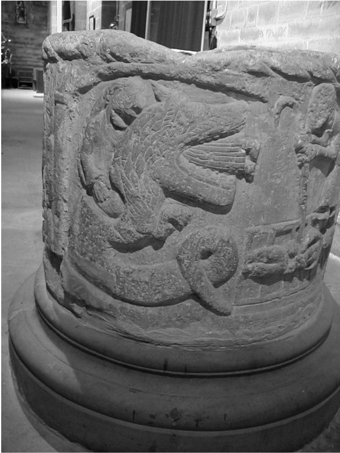
Figure 16 Baptismal Font, Cottam, detail of St. Margaret.