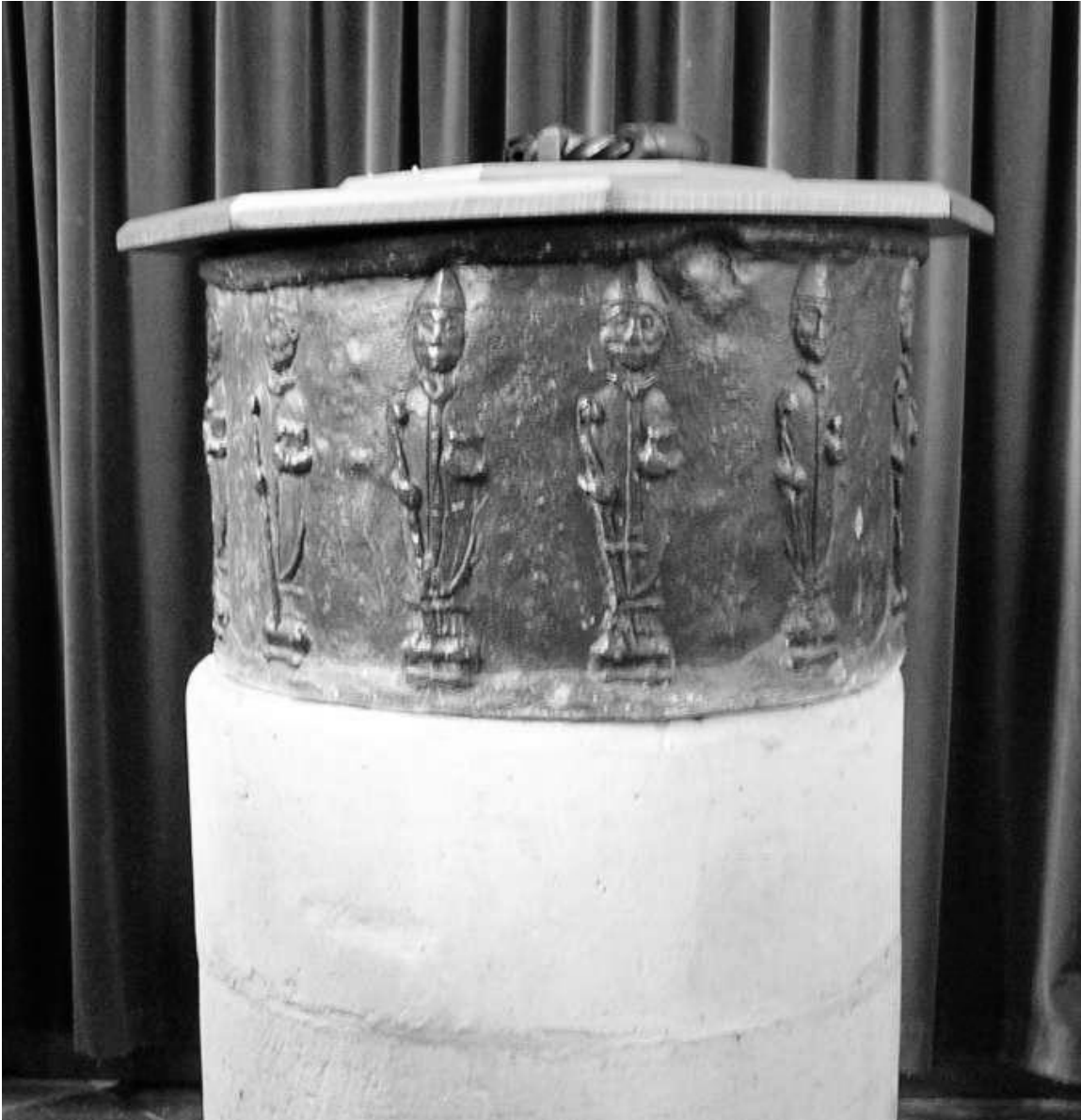
Figure 1 Baptismal Font, Childrey (Berkshire), twelfth century.