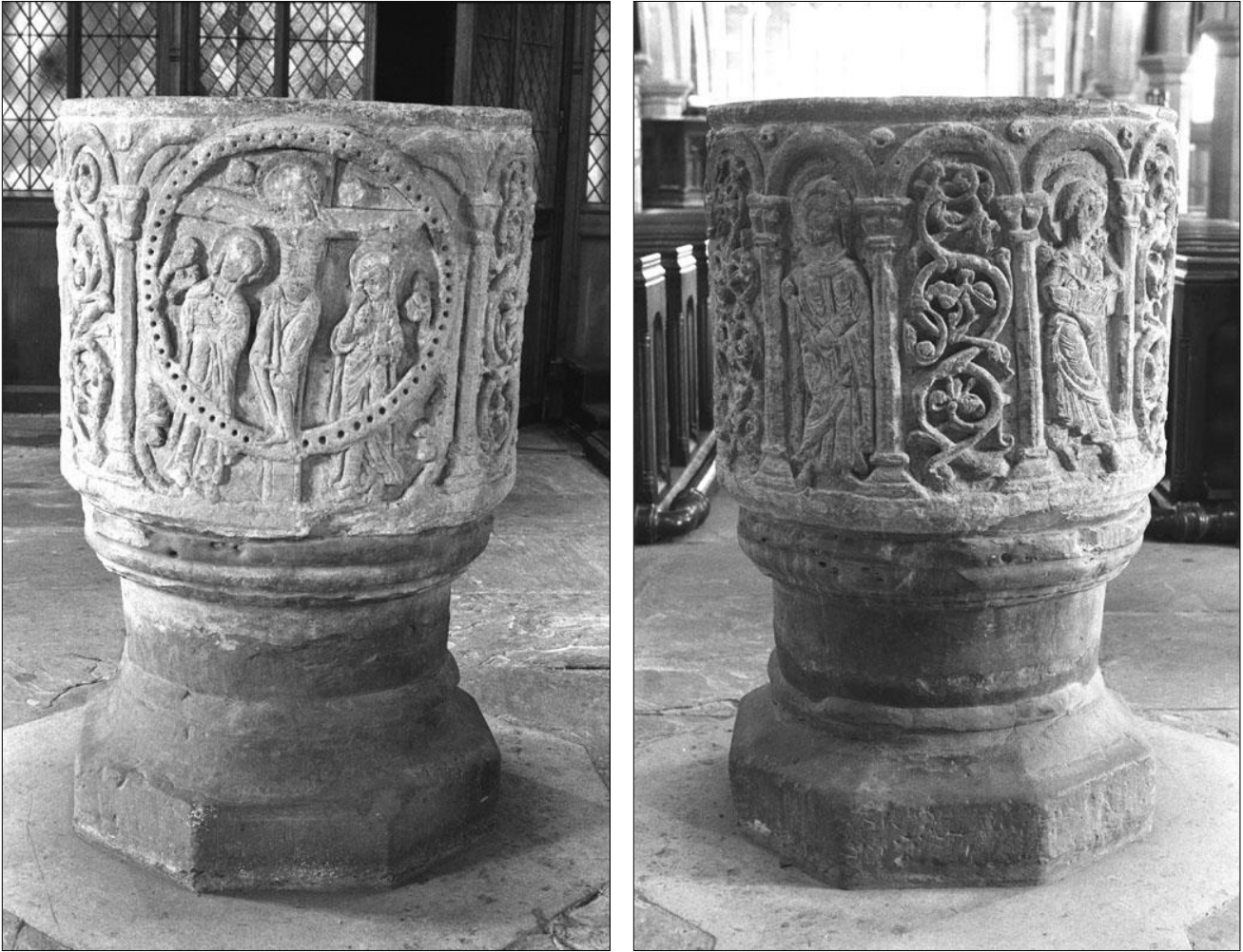
Figures 2, 3 Baptismal Font, Coleshill (Warwickshire), c. 1140-1160.