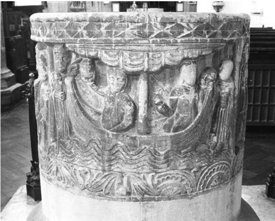
Figure 10 Baptismal Font, Brighton (Sussex), c. 1150-1200.

time. The baptismal scene, with an attendant angel and John the Baptist dressed as a contemporary priest holding either a chrismatory or ciborium, links the historical past of Christ's baptism with the liturgical present of the candidate's baptism, all with a recurrent theme of the role of the sacraments within the Church institution. 91 The Last Supper establishes the Eucharist within the Church and must be seen as a reference to it here. These two scenes alone create a visual statement consonant with contemporary sacramental systems.