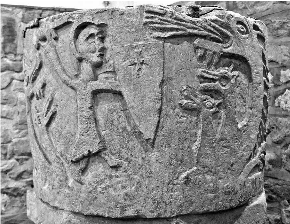
Figure 7 Baptismal Font, Thorpe Arnold (Leicestershire), c. 1125-1150.

Unlike the Scandinavian fonts of the period, which tend to be more specific in their handling of St. Michael, the English fonts tend to avoid clear reference to his