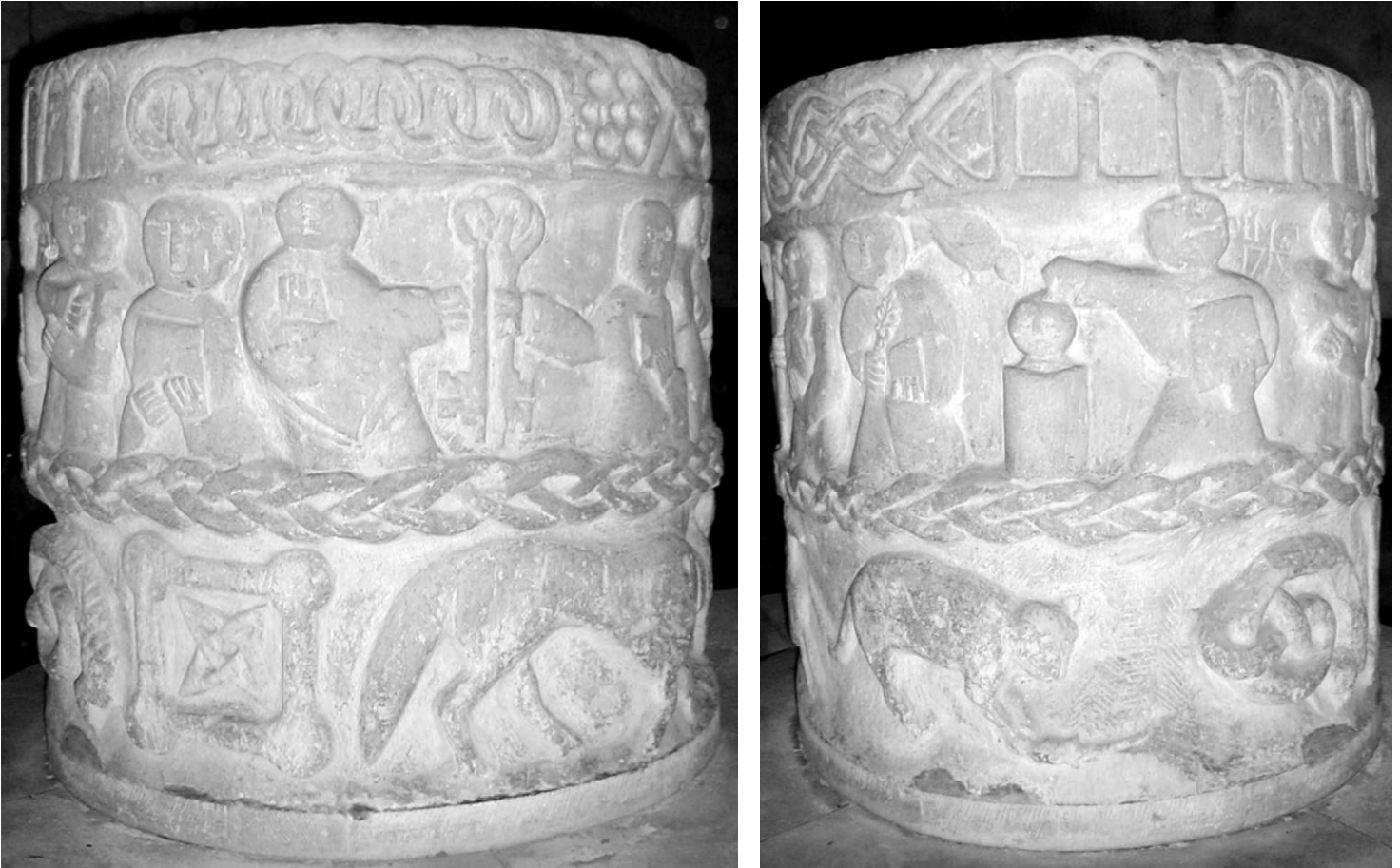
Figures 5, 6 Baptismal Font, Kirkburn (East Riding, Yorkshire), c. 1150-1175, (left) detail of the Charge to Peter and (right) detail of the Baptism.

executed font is complicated, entailing a narrative band separate from a band of isolated and non-narrative elements. The upper band might at first glance be read as the baptism of Christ, ( Figure 6 ) the charge to Peter, and Christ in Majesty, either as in a resurrection/ascension from Jesus' mortal life or as a Second Coming; all three scenes are interspersed with images of standing figures, many with books, some with crosiers or other ecclesiastical equipment.