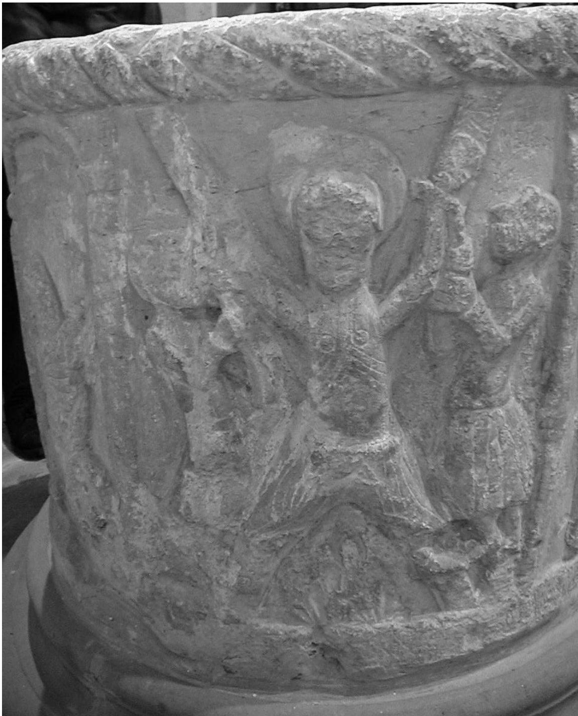
Figure 14 Baptismal Font, Cottam, detail of St. Andrew.