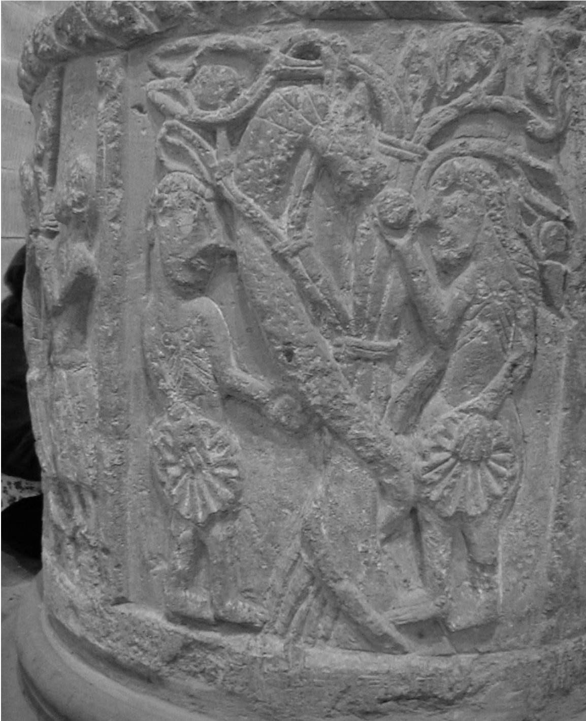
Figure 13 Baptismal Font, Cottam (East Riding, Yorkshire), c. 1135-1145, detail of the Temptation and Fall of Adam and Eve.