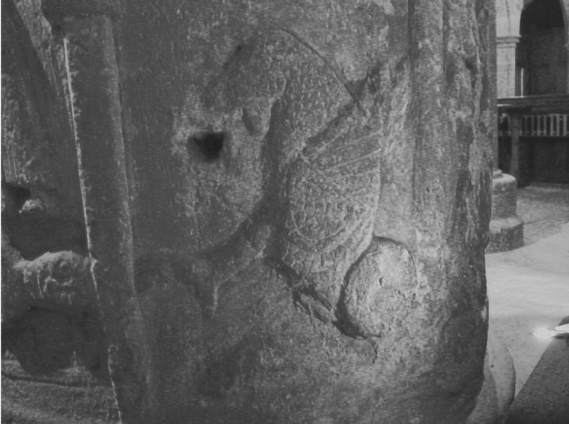
Figure 12 Baptismal Font, Cottam (East Riding, Yorkshire), c. 1135-1145, detail of the beast.

on the grill and the crucified figure and is notably smaller than the other sections on the font, suggesting that perhaps the unequal layout of the design was a problem of execution