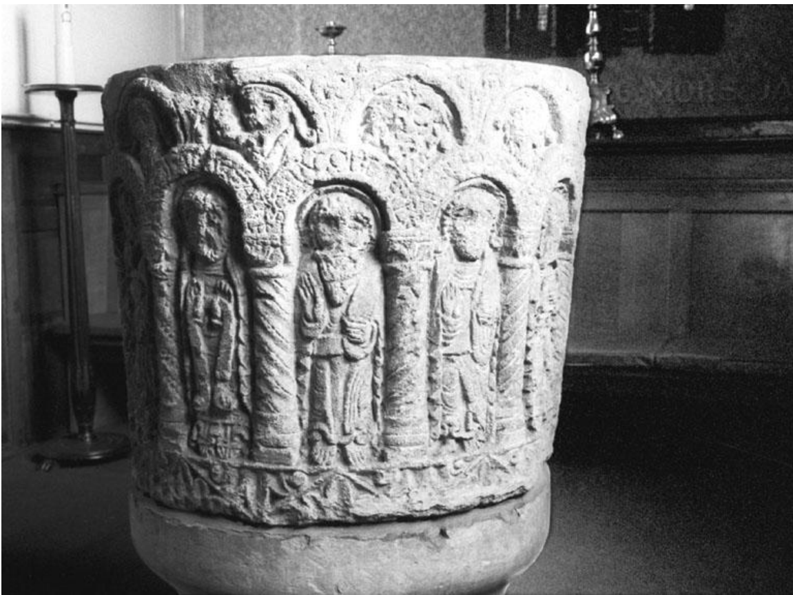
Figure 4 Baptismal Font, Stoneleigh (Warwickshire), c. 1150-1175.

The salient information about the Coleshill figures—that they are saints—remains clear regardless of their original legibility and we must wonder whether their identity as particular saints was as important as their general holy status. If we approach the figures as iconographers, intent on identification, we must be disappointed. For the faithful parishioner, the generic representation might indeed be preferable as a way to project the specifics of each catechumen and his or her own particular saint onto the figure. The