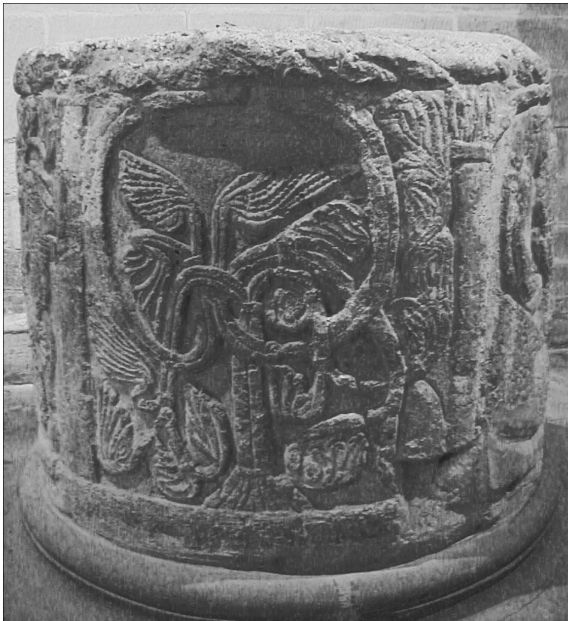
Figure 11 Baptismal Font, Cottam (East Riding, Yorkshire), c. 1135-1145, detail of the Tree.

The distinctive touch of the sculptor, however, is also evident here: the figures all have a firm profile with large triangular noses and jutting chins. Finishing details such as breasts and ribs are included as important, but regularized so that there is little anatomical individualization. A thick Anglo-Norman style cable is carved around the upper rim, a