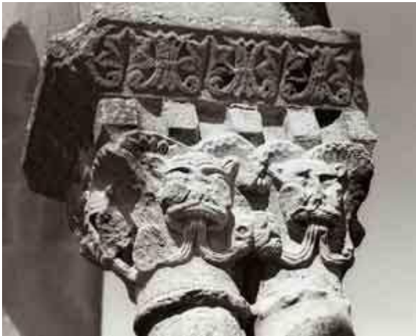
Column Capital, Church of Eunate, Navarra, Spain, Romanesque Period.