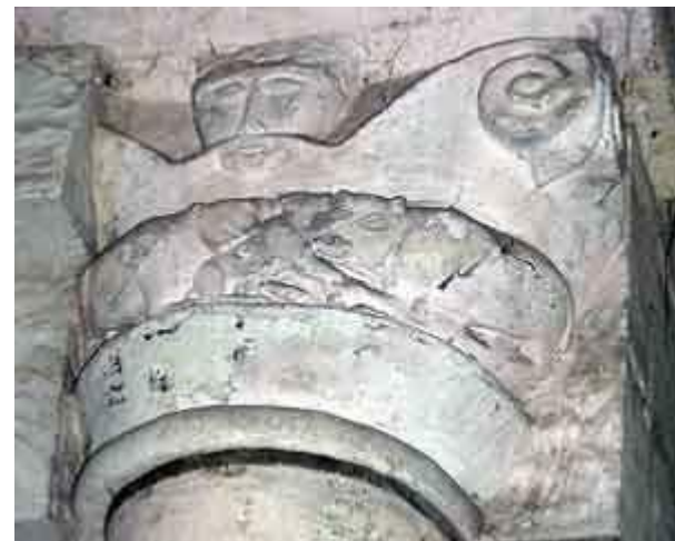
Face with Ionic-style curls, capital sculpture in the narthex. Loches Church of Saint Ours, 12th Century, Romanesque Period, (Indre et Loire), Touraine, France.