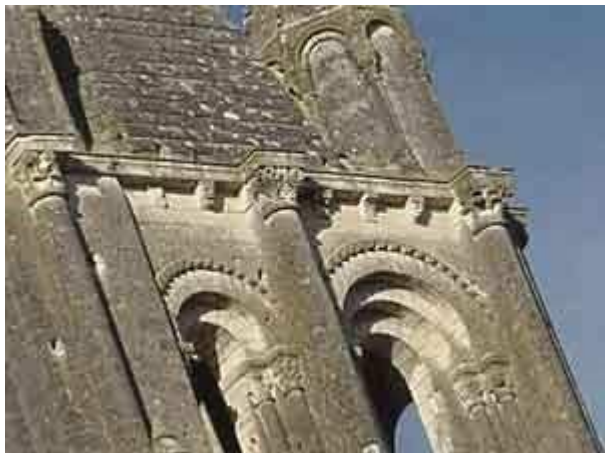
View of tower with cornice and brackets. Loches Church of Saint Ours, 12th Century, Romanesque Period, (Indre et Loire), Touraine, France.