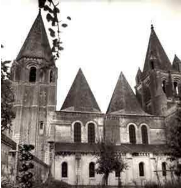
Exterior from the south side. Loches Church of Saint Ours, 12th Century, Romanesque Period, (Indre et Loire), Touraine, France.