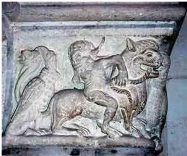
Fantastic animal, capital sculpture in the narthex. Loches Church of Saint Ours, 12th Century, Romanesque Period, (Indre et Loire), Touraine, France.