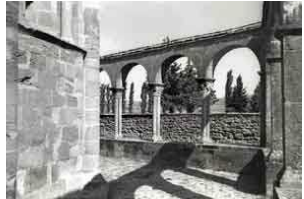
View of Columns, Church of Eunate, Navarra, Spain, Romanesque Period.