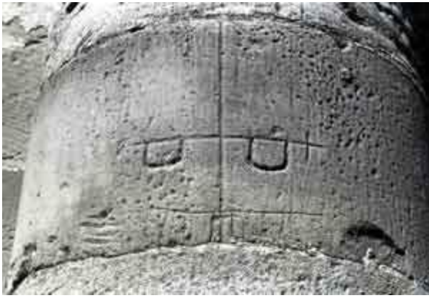
Mason Marks, Church of Eunate, Navarra, Spain, Romanesque Period.