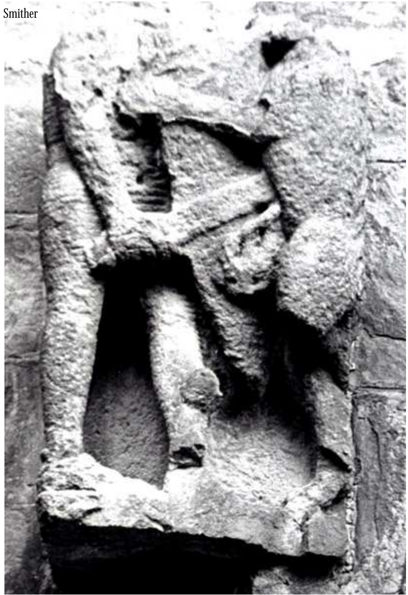
Detail of the left side of the west entrance, Church of Santiago, illustrating combat Puente la Reina, Spain