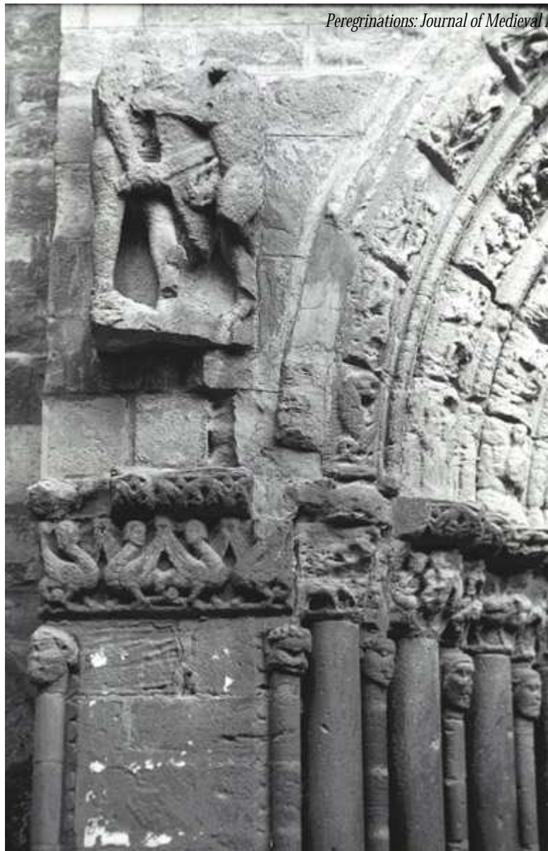
Detail of the left side of the west entrance, Church of Santiago Puente la Reina, Spain