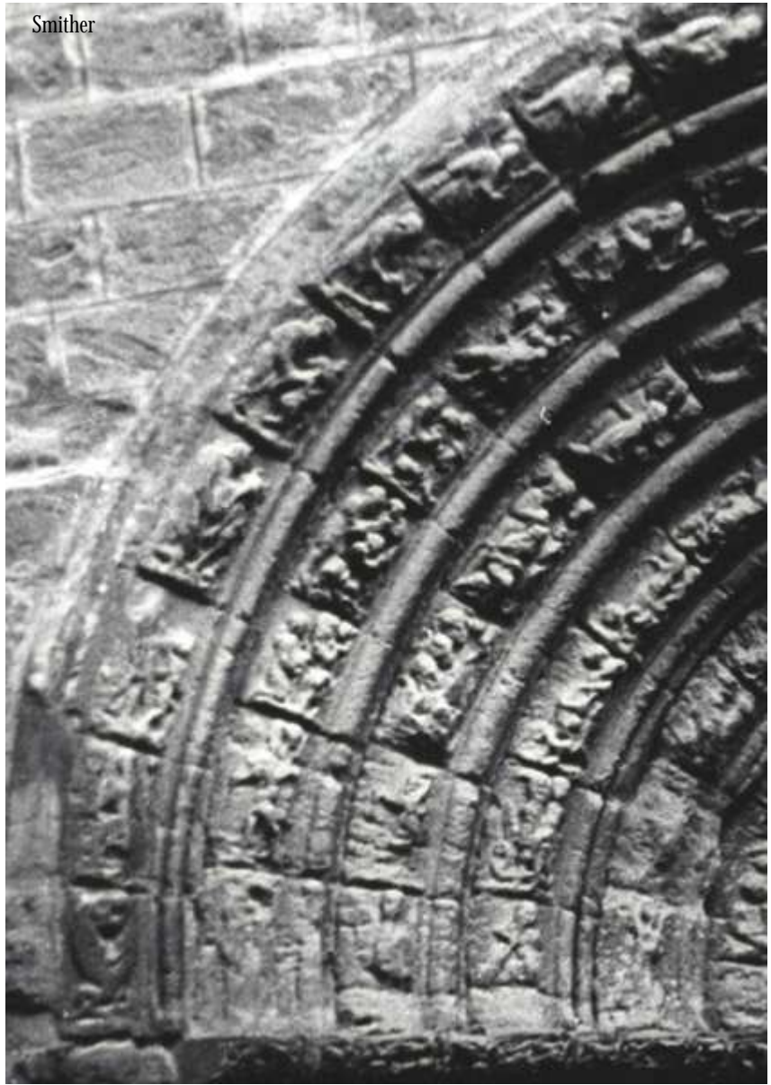
Detail of the sculpture from the Archivolt entrance, west façade of the Church of Santiago Puente la Reina, Spain