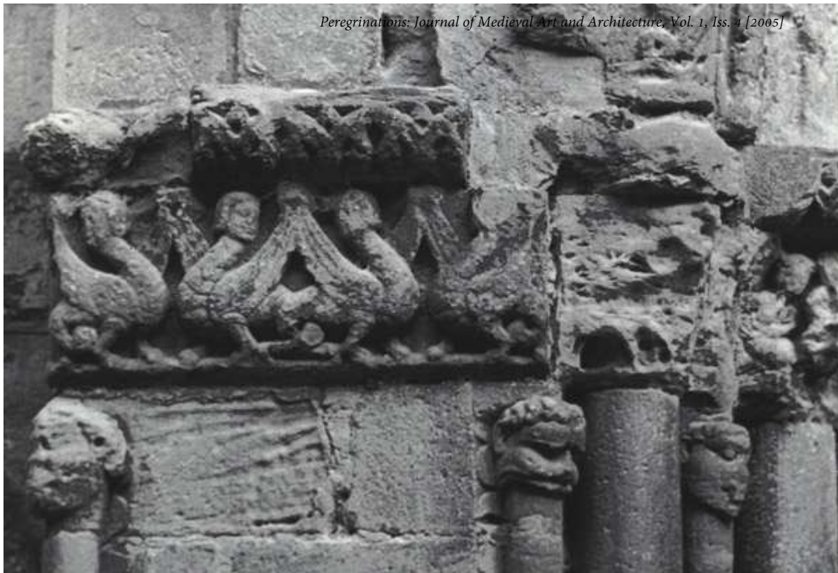
Detail of the left side of the west entrance, Church of Santiago, sculpture and column capitals Puente la Reina, Spain