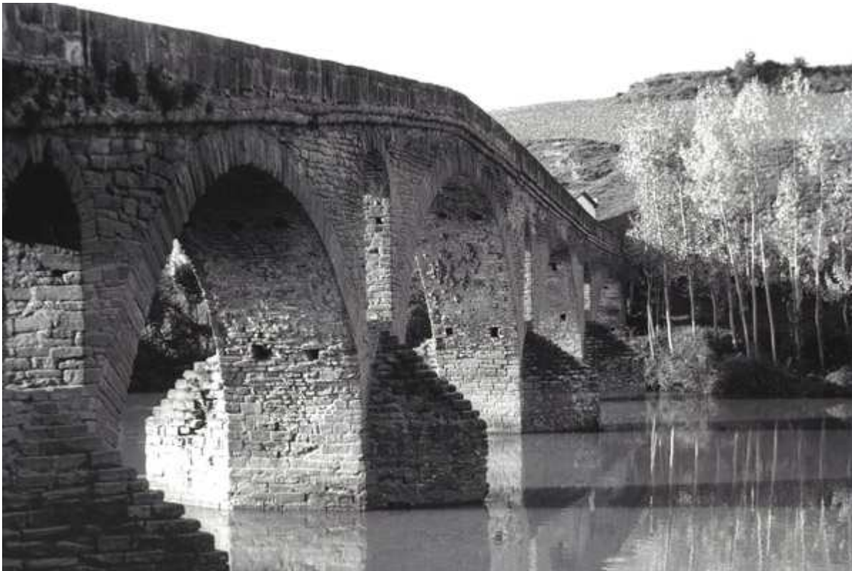
Puente la Reina Bridge Puente la Reina, Spain