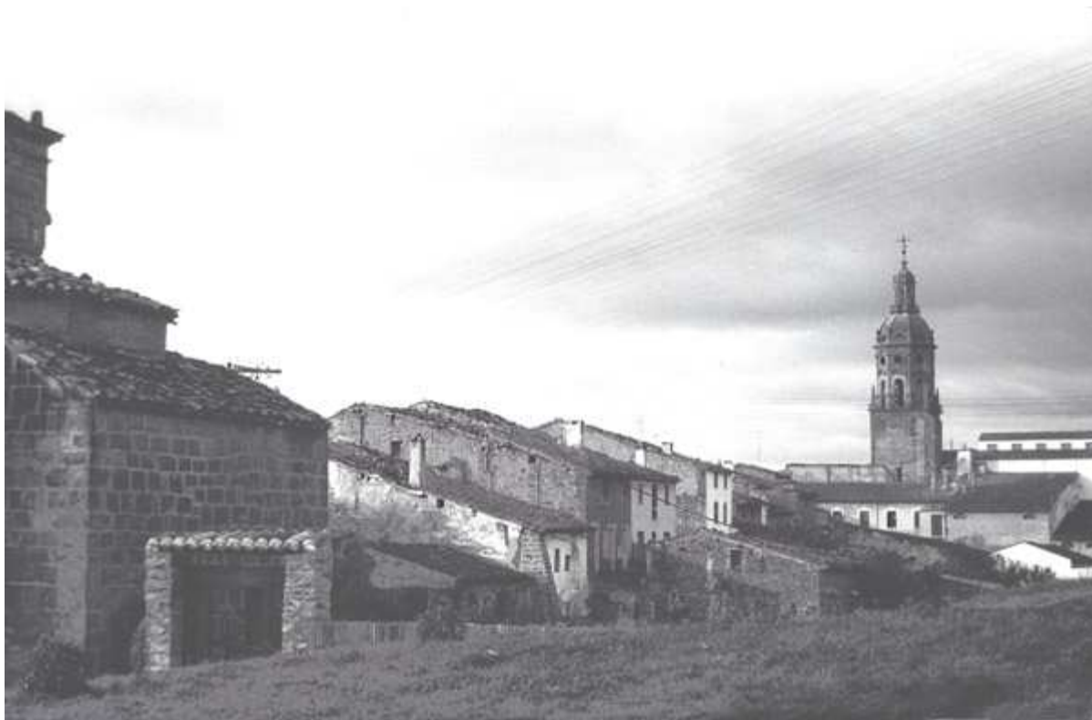
The town of Puente la Reina Puente la Reina, Spain