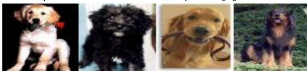
Figure (6): Intra-Class Variability.

This difference among real scene and image information is known sensory gap Figure ( 7) [9, 10]. In classification procedure the main lack is the difference among the visual features of image and the objects, meanings that this image as perceived by a human. This is named semantic gap and it is define as the lack of coincidence among the information that can extract from the visual data and the analysis that the same data from a user in given situation [9].