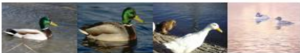
Figure(3): Size scale variation