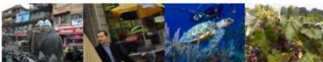
Figure (4): Background Clutter