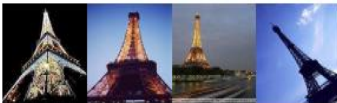
Figure (5): Viewpoint