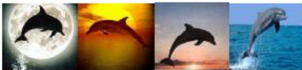
Figure (2): Illumination variation