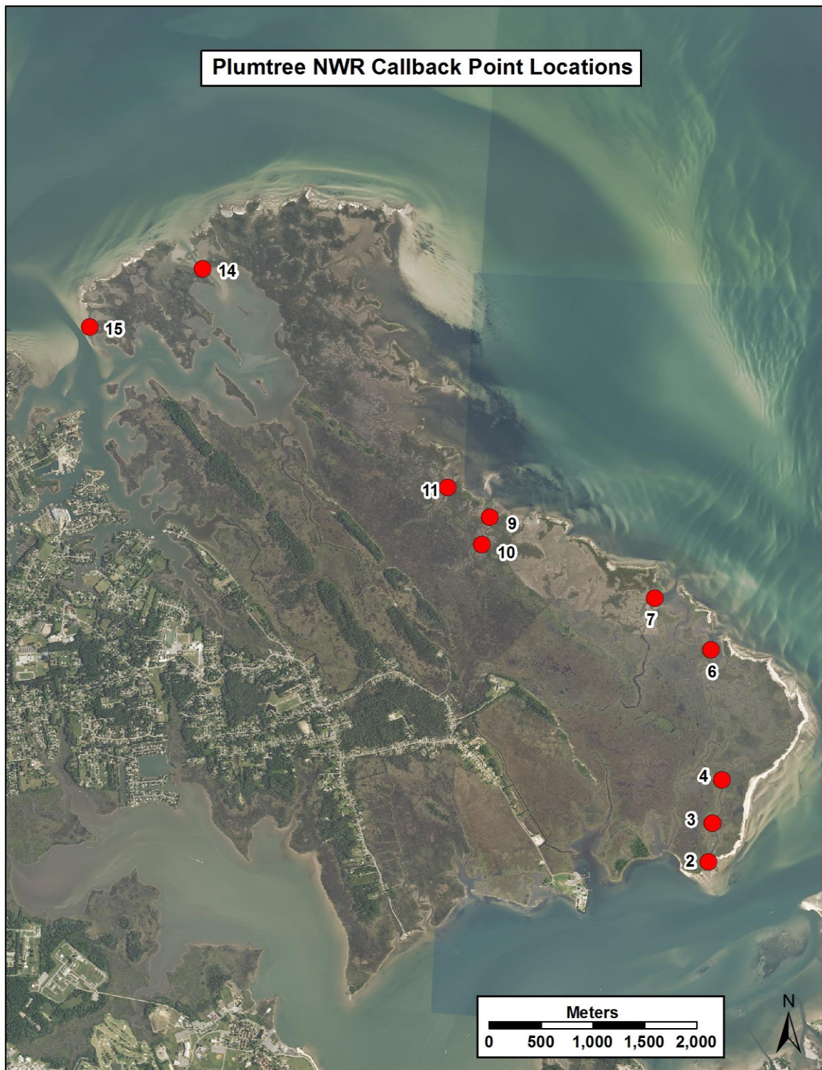
Figure 3. Map of the ten point-count locations within the marsh habitat of Plum Tree Island used for the point count survey.