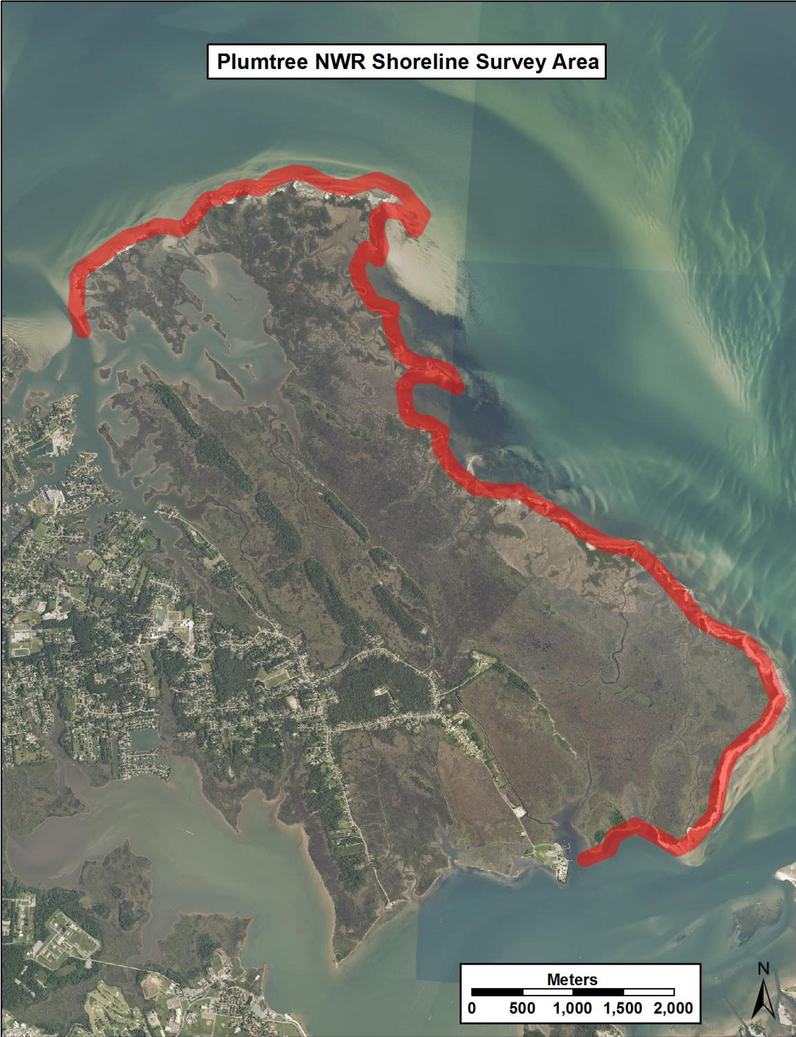
Figure 1. Map of the 100-m wide band transect positioned along the outer shoreline of Plum Tree Island to conduct bird surveys.