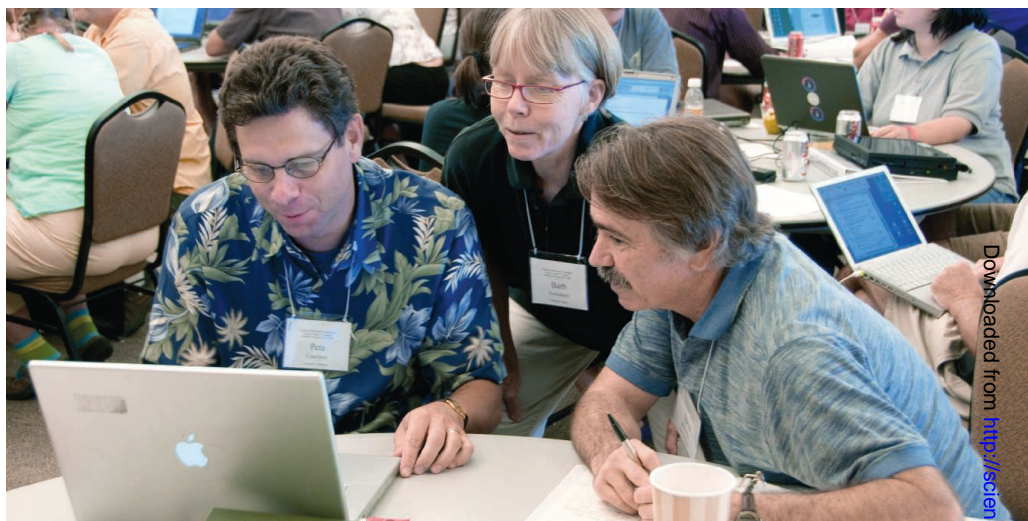
Workshop participants generate much of the Web site content. Here, participants in the 2008 Teaching Introductory Geoscience workshop work together to improve their contributions to the teaching activity collection.

To date, ~1400 geoscience faculty from more than 450