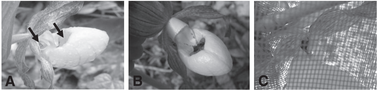
Figure 1. A–C. Cyripedium parviflorum var. pubescens from the experimental plot showing lip morphology and trapping device. A, Side view of bloom showing large entrance orifice (right arrow) and escape orifice partially occluded by an anther (left arrow). B, Andrena perplexa individual inside the labellum with the ribbon covering the exit holes. C, Andrena barbara escaping from an exit hole into mosquito netting after the ribbon was removed.

food-deceptive orchids that attract adult insects that are seeking food for themselves or a brood-place for larvae (Pridgeon et al. , 1999). In this subfamily, the highly modified petal (the labellum) is modified into an inflated pouch with an entrance orifice and two basal escape orifices, each partially occluded by an anther (Fig. 1A). Visitors enter the labellum through the large entrance orifice and, if they are the right size and shape to be pollinators, they have difficulty escaping out of the entrance. Usually not more than 10 min after imprisonment (Nilsson, 1979), pollinators crawl beneath and press up against the stigma. This action transfers any pollen they may be carrying to the stigmatic surface and gives them leverage to widen the exit hole (Nilsson, 1979). Subsequently, the insect squeezes out of one of the two exit holes, picking up a new mass of pollen. For pollination to occur, a pollinator must be tricked into entering and correctly exiting at least two flowers.