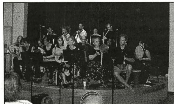
College of William and Mary's Middle Eastern Music Ensemble

hour-long performance by the College of William and Mary's Middle Eastern Music Ensemble, which consists largely of college students singing and playing such instruments as the oud (predecessor of the lute), kaman (violin), nay (end-blown reed flute), qanun (zither-like plucked instrument), and percussion instruments such as the durbakkah (hourglass drum) and daff (tambourine). Seventeen members of the ensemble performed traditional and contemporary pieces, thus providing the music teachers in attendance a wonderful example of the instruments and sounds and qualities that they had been learning about during the workshop. The program was organized by CCAS with a special grant from the US Department of Education's Title VI program, which is funding a National Resource Center on the Middle East at Georgetown University. ●