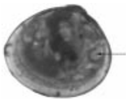
Figure 3. Postlarva of Macoma sp. collected in the plankton in the York River, VA. Note the anterior adductor muscle, visible through the shell (arrow). Shell length is 450 \mu\text{m} .

selves in the water column while they metamorphosed, but the evidence for this was not presented.