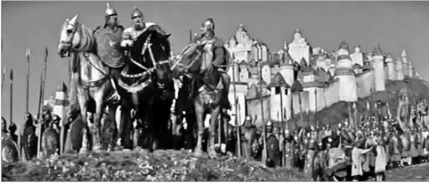
Fig. 75. Il'ia Muromets

political pluralism. While these events created an oppressive atmosphere in Soviet society, I would like to argue that, in Soviet cinema specifically, the political clampdown started with the creation by the KGB's newly appointed chief Yuri Andropov of the Fifth Main Administration for Ideological Subversion (1967). The First Department of this Administration was responsible for policing the Soviet artistic intelligentsia, filmmakers among others. By the mid 1970s, this new KGB unit and the Ministry of Cinema (Goskino) had established very close state control over the minds and deeds of Soviet filmmakers.