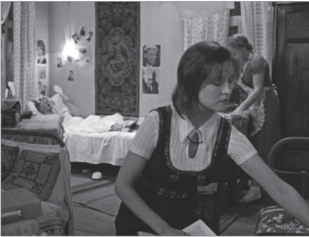
Fig. 76. The Dorm Room

Soviet Screen's color publicity photographs had a tremendous impact on the everyday life of Soviet people. They began decorating their apartments and dorm rooms with photos of film stars. To create a 1950s atmosphere in Moscow Does Not Believe in Tears ( Moskva slezam ne verit , 1979), director Vladimir Men'shov chose photographs from Soviet Screen for the walls of dorm rooms as the most memorable feature of the period's interiors (Fig. 76).