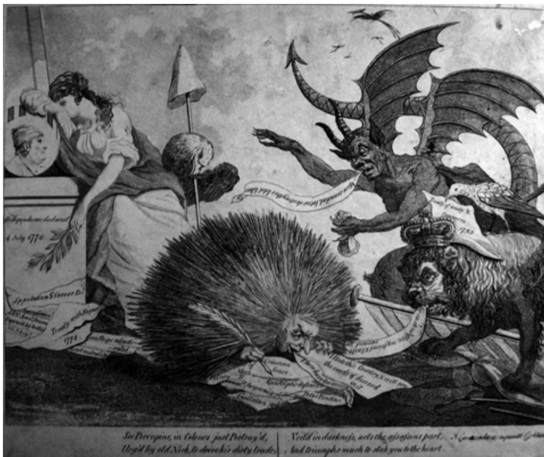
Figure 2. See Porcupine in colours just Protray'd. Moreau de Saint-Méry, Philadelphia, 1796.

impressed with jealousy and apprehension.” 30 Indeed, by aligning themselves with England, even if only commercially, Americans risked the danger “that the government of the United States may be transformed through the medium of treaty-making power, from a republic to an oligarchy.” 31 In 1796, Moreau de Saint-Méry illustrated the British threat in his political cartoon “See Porcupine in colours just Protray’d” (fig. 2). The Philadelphia artist portrays the vicious Federalist printer William Cobbett as Peter