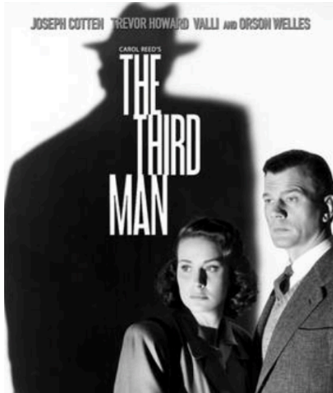
Figure 4 - Movie poster for The Third Man , a film noir piece that the International Spy Museum's logo mimics.

Third Man . [fig. 4] 86 The second logo is reminiscent of the classic James Bond film trailers that use Bond's pistol bearing body at the end of a gun barrel as a significant part of the franchise's branding. [fig. 5] 87 Additionally, these logos, along with the branding for the entire museum, use a black, white, and red color scheme, which is frequently associated with old Hollywood's black and white films and red carpets. Furthermore, the black and white theme mimics the moral simplicity the narrative of the museum presents, in which American actions are lauded as beneficial, necessary, and even heroic, while the organizations that they act against are either villified or given little attention. Within the