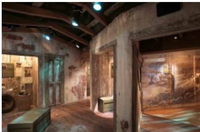
Figure 10 - The "Spies Among Us" exhibit

The penultimate portion of the museum is titled "Exquisitely Evil" 103 and is dedicated to James Bond and the villains that plague him. This is an interesting choice for a museum that, only four years ago, boasted "that only 5 percent of its exhibits deal with