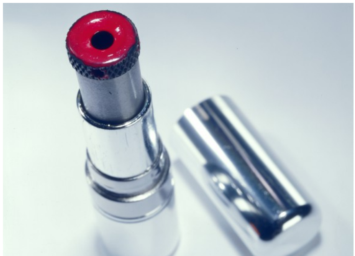
Figure 1 - "Kiss of Death," a pistol disguised as a tube of lipstick that is displayed in the "School for Spies" Exhibit.

However, there are several leading media outlets that give the attraction mixed reviews. Washington Post Staff Writer Michael O’Sullivan claims that the institution “intelligently addresses both the very real dangers and the enduring allure...of spycraft,” 39 but he also