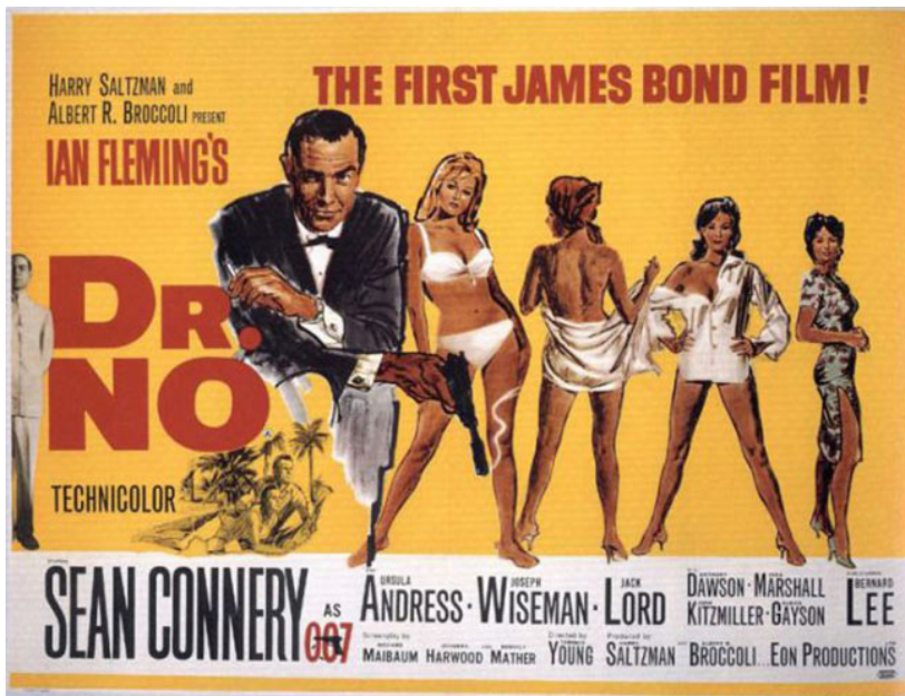
Figure 13 - Movie poster for the first James Bond film, Dr. No , depicting the misogynistic portrayal of women as interchangeable and sexually available for Bond.

At its best, according to Michele Henning, interactivity is used in museums to “turn ‘unfocused visitor-consumers’ into ‘interested, engaged and