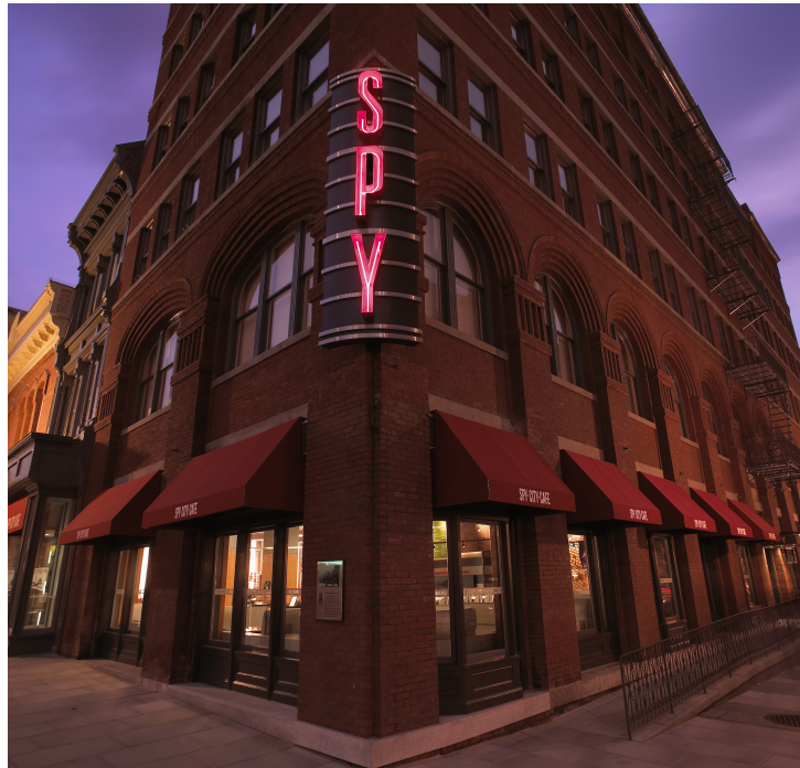
Figure 7 - Museum exterior

Once inside the museum, the schedule created by the interior layout sets up a very controlled experience. There are six main sections of the Spy Museum that must be accessed in a certain order. The attraction begins with “Covers and Legends,” 93 the most interactive section. [fig. 8] 94 In this section visitors’ photos are taken on a