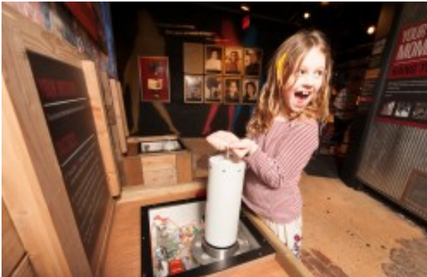
Figure 12 - A child pretends to detonate a bomb in "Exquisitely Evil: 50 Years of James Bond Villains."

Although the International Spy Museum's aesthetic and content strongly influence the message the institution presents, what has the greatest impact on visitors and sets this exhibit apart from traditional museums is its heavy reliance on exhibit-visitor interaction. The attraction is engineered so the museumgoer cannot gain the full experience without physically participating in a portion of the displays. This chapter considers the role of the museumgoer in the institution and how the interaction between the two, through physical tasks, the museum's soundscape, supplemental activities, and first-person performance, gives greater meaning to the museum and its ideology as a whole.