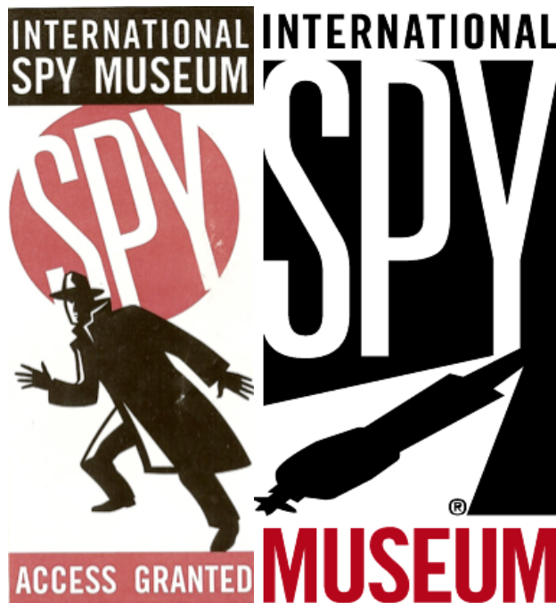
Figure 3 - Museum logos

Several advertisements portray spies in the suggestive, smooth way that they are frequently represented in films such as the James Bond series. One advertising campaign included a series of images of agents “hiding” in the local metro stations including men in tuxedos, and women in red slinky gowns and black cat suits. [fig. 2] 83 Other posters in the same location involve a coded word that the viewer must text to a certain number to decipher the encrypted message. Another advertisement allows the viewer to interact with a projection on the wall of the underground. The projection includes three people of seemingly different age, gender, and ethnicity. When one passes in front of the projection the disguises melt away, revealing that the same person is pictured in each display. 84