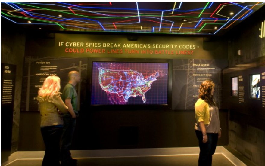
Figure 11 - The "21st Century Exhibit"

“21 st Century Exhibit” 105 is the museum’s last display, located in a small room directly outside of the gift shop. [fig. 11] 106 This display is one of the wordier portions of the institution. It discusses current events in espionage; specifically focusing on the threats that exist in cyberspace and the way the United States has and can deal with those potential problems. It involves film clips of the president issuing a warning regarding threats such as the ones discussed, and explores the hypothetical consequences of a terror strike to the power grid.