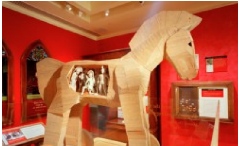
Figure 9 - The Trojan horse exhibit in "The Secret History of History" exhibit

Trojan Horse strategy. [fig. 9] 100 It also dedicates several rooms to events significant in American history, such as the Revolutionary War, the Civil War, and the Cold War.