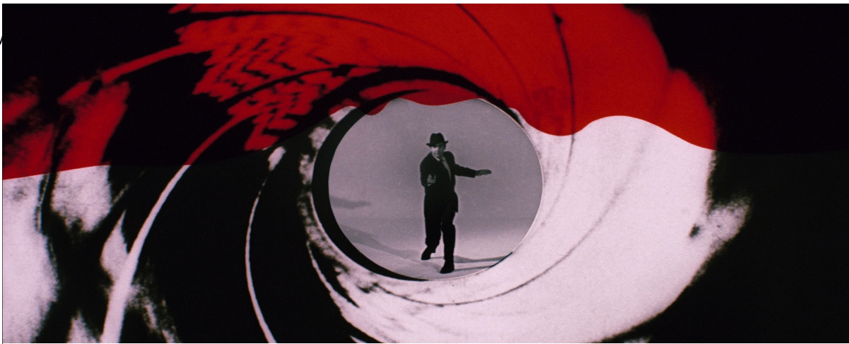
Figure 5 - James Bond vector logo, featured at the end of the movie trailer for You Only Live Twice

National Mall, and one block from the FBI and the Crime Museum, just across the street from the National Portrait Gallery. The proximity to major national landmarks, such as the National Mall, gives the impression that this museum represents the power, knowledge, and opinions of the nation. The proximity to prominent intelligence officers that work for the FBI or within the White House implies access to inside knowledge unavailable elsewhere. Finally, the proximity to the National Portrait Gallery and other Smithsonian Institution museums leads many tourists to assume that the institution is in some way associated with the prestige of the “world’s largest museum and research complex.” 88 These local factors combine to strengthen the museum’s authority. However, the more clout the museum has, the more responsibility it arguably has to present accurate and factual information, but the International Spy Museum falls short of this responsibility by selling fiction, rather than fact.