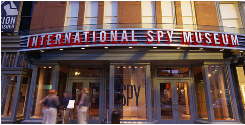
Figure 6 - Museum main entrance

in the world.” 89 This immediately instills in museumgoers a sense of excitement and adventure as they realize that they have been surrounded by this phenomenon for their entire visit to the city, and implies that they too could join the ranks of clandestine agents who are apparently roaming the streets. Visitors are primed to play out this fantasy, taking on the role of a spy throughout the museum as they engage in interactive exhibits.