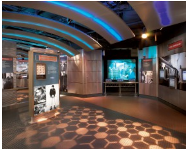
Figure 8 - "Covers and Legends" exhibit

The United States Holocaust Memorial Museum assigns visitors identities of concentration camp victims and follows the historical account of these stories from the victims' birth until the end of the Holocaust. 95 However, unlike the identities at the Holocaust Museum, the covers at the International Spy Museum are entirely fabricated, so follow-up information is not provided regarding the activities and fate of the assumed identity. The fictional descriptions only include the name, age, ethnicity, occupation, and goals of the individual that one is impersonating. The identities are purposefully fictitious, in order to mimic the lie that espionage agents must live in order to protect themselves. In this section the museumgoers are told that they "may be asked to 'live their cover'" during any point of their experience, therefore they must be prepared to go undercover "just like an actor on stage." 96