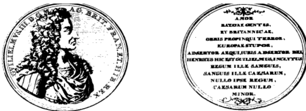
Figure 2. William III as “the terror of all his neighbors.”