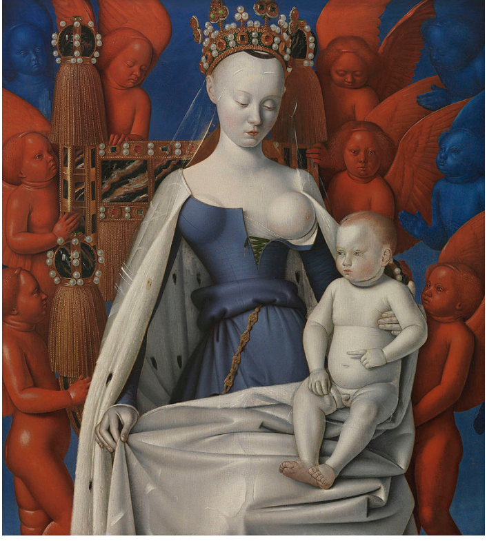
Figure 6: Jean Fouquet, right wing of the Melun Diptych , 1452, oil on panel, 94.5 x 85.5 cm, Koninklijk Museum Voor Schone Kunsten Antwerpen