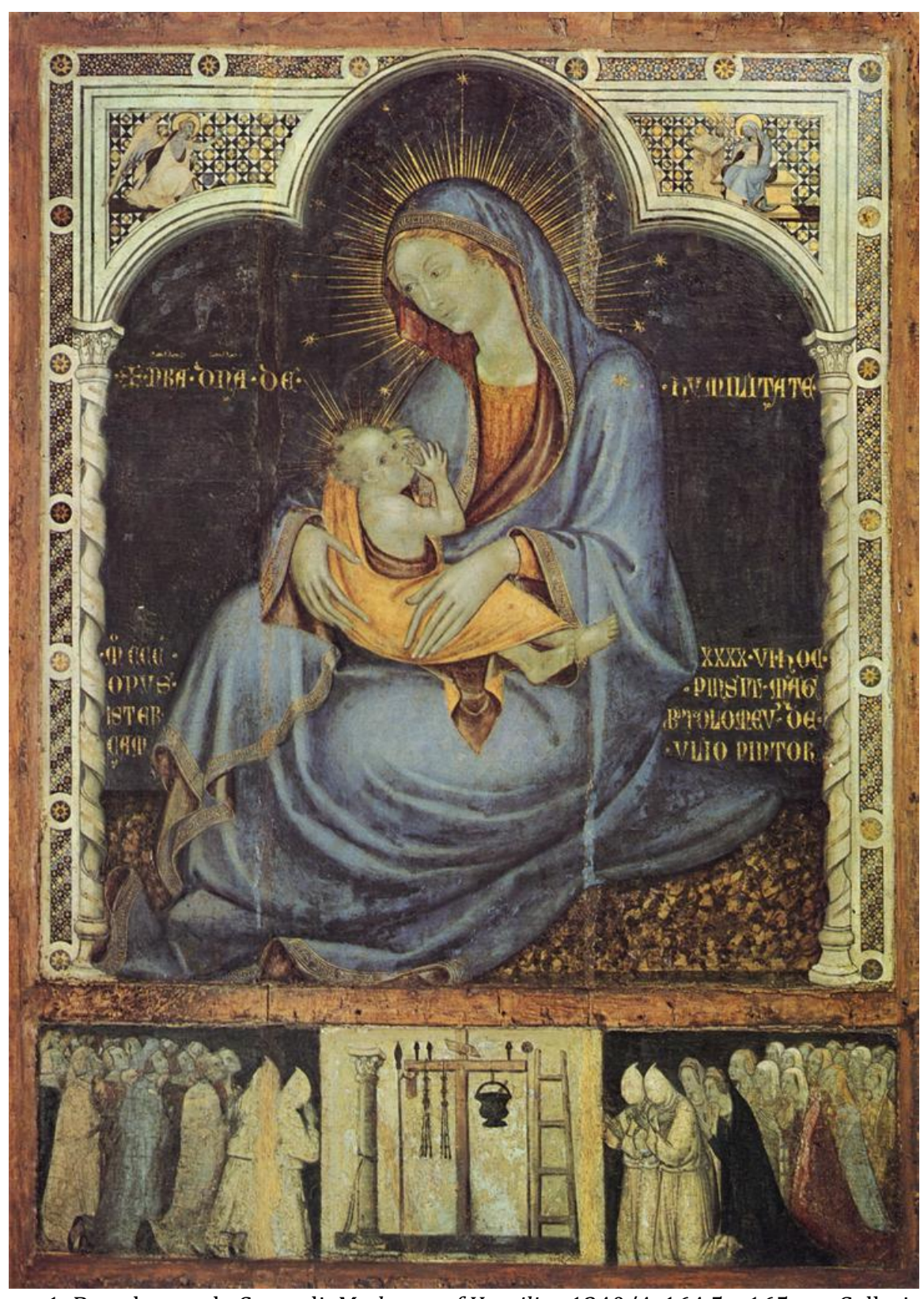
Figure 1: Bartolomeo da Camogli, Madonna of Humility , 1340/4, 164.5 x 165 cm, Galleria Nazionale della Sicilia