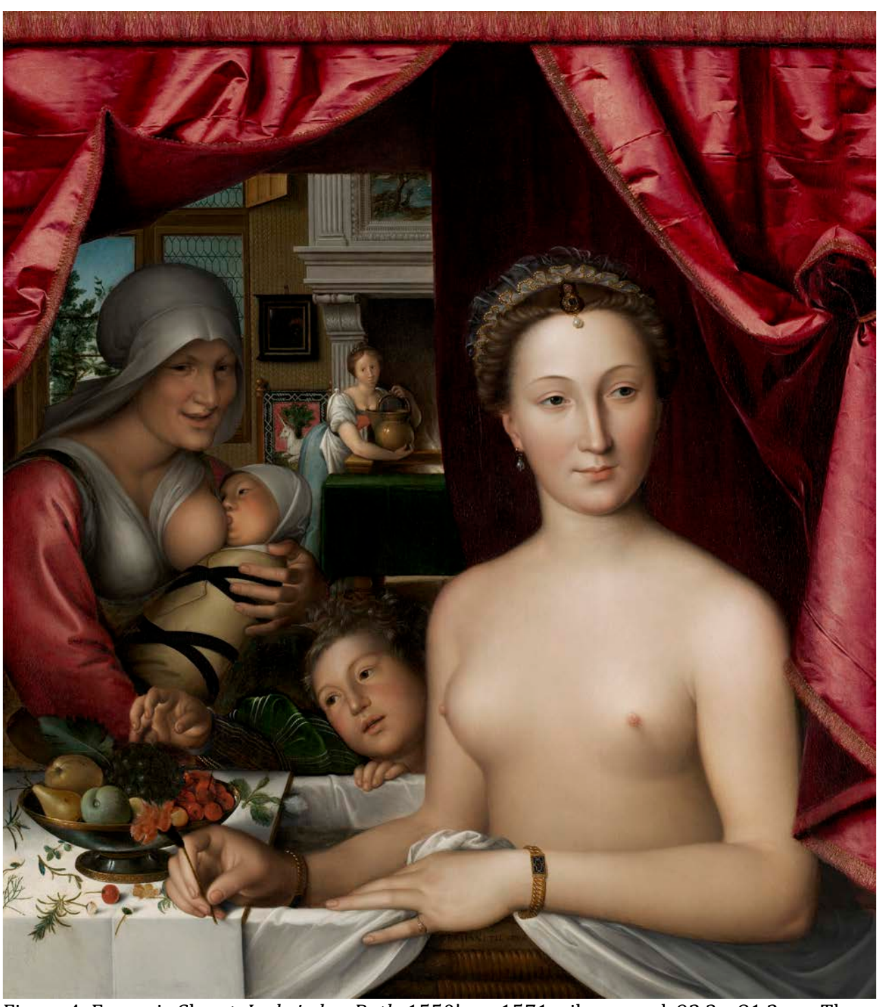
Figure 4: François Clouet, Lady in her Bath , 1550's or 1571, oil on panel, 92.3 \times 81.2 cm, The National Gallery of Art, Washington D.C.