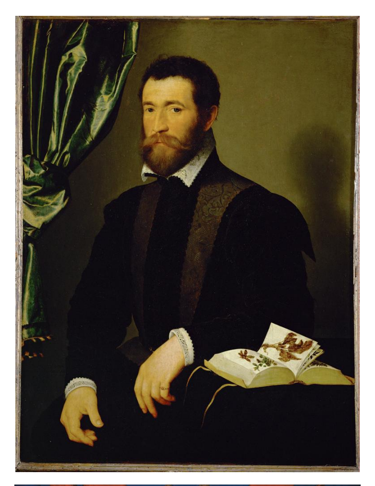
Figure 5: François Clouet, Pierre Quthe, an Apothecary , 1562, oil on panel, 91x70cm, Musée du Louvre