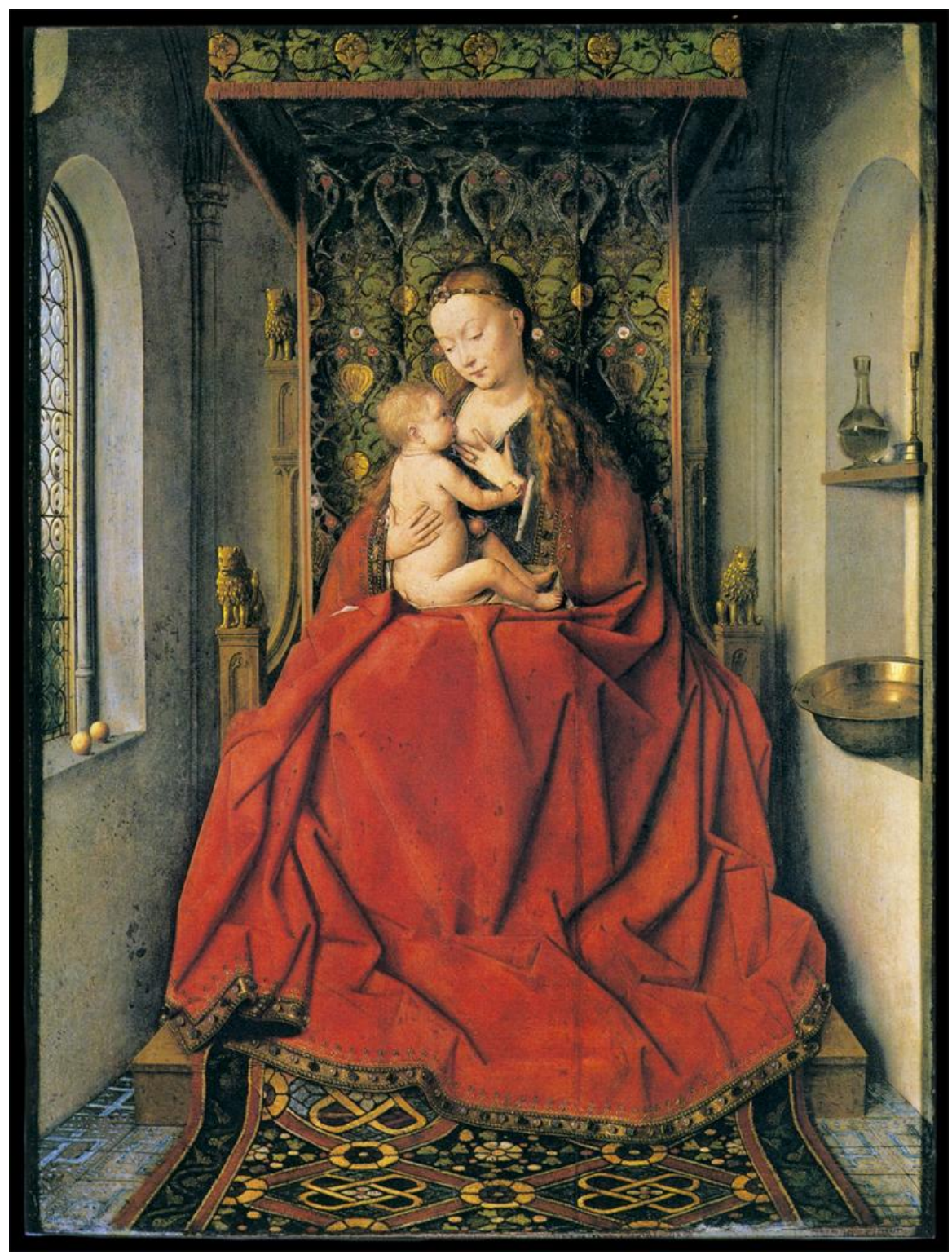
Figure 3: Jan van Eyck, Lucca Madonna , 1436, oil on panel, 65.5cm x 59.5cm, Frankfurt Städelsches Kunstitut