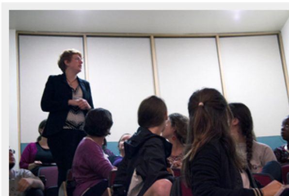
Discussion after screening

The Hunting Ground aims to bring awareness to the topic of sexual assault on college campuses. Unfortunately, the documentary addresses an extremely relevant issue at Skidmore.