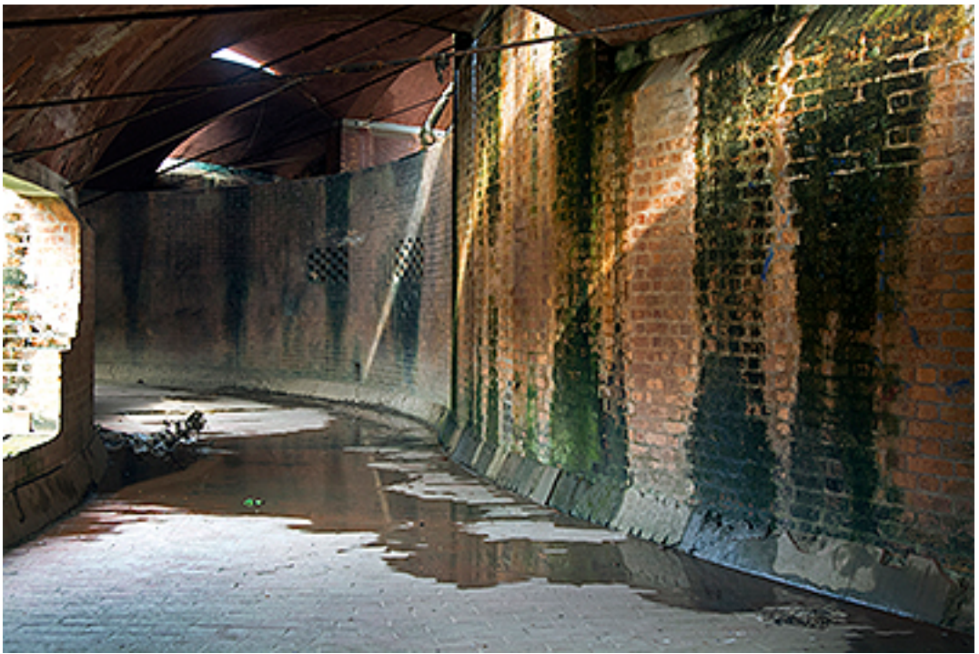
Untitled - Havana, Cuba

Listen to audio clip about this photo: <u>http://www.skidmore.edu/mdocs/news/2015/audio/DorotheaCuba-Landscape.mp3</u>