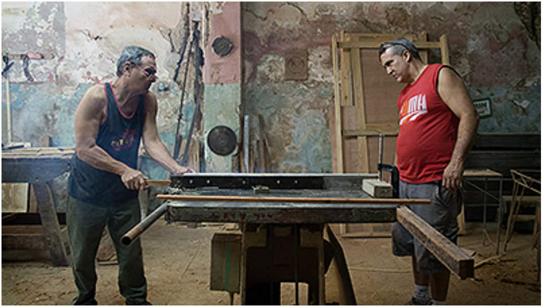
Untitled - Havana, Cuba

Listen to audio clip about this photo: http://www.skidmore.edu/mdocs/news/2015/audio/DorotheaCuba2-Event.mp3