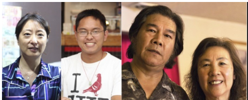
November 2015 Researching New York