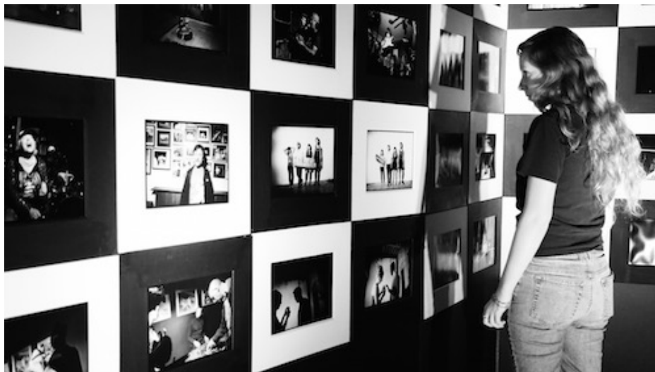
Tri-X Noise pop-up exhibit in Falstaff's