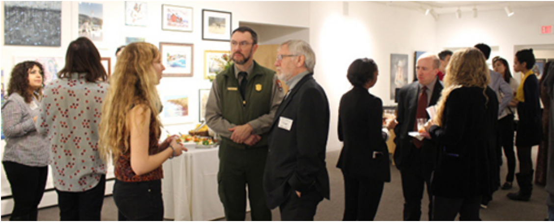
Networking night conversations.