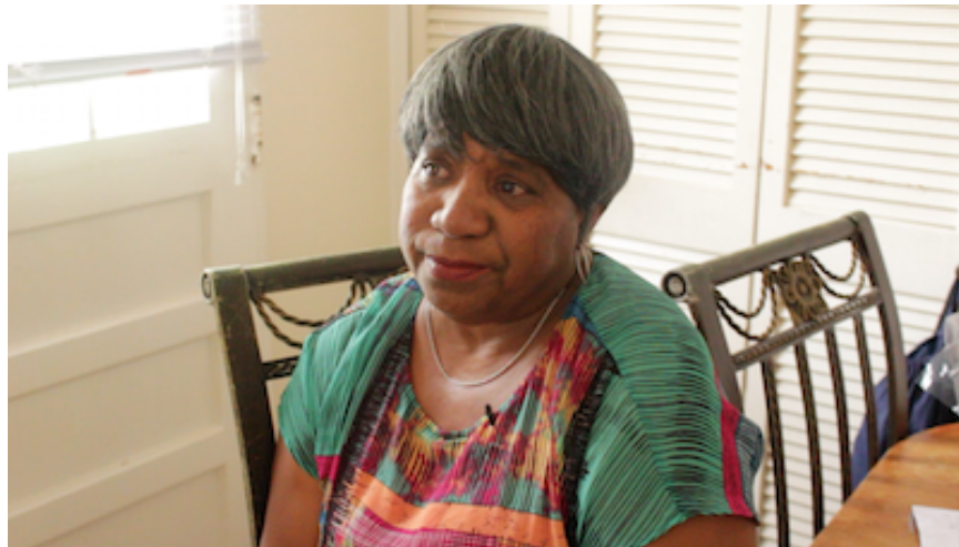
Film still of Maryam's grandmother, the narrator of the film

http://www.skidmore.edu/mdocs/news/2015/audio/121415-sthighlight-dewitt-audio.wav