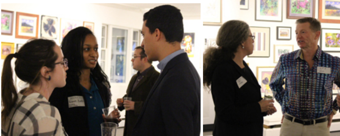
Networking at Saratoga Arts.

This past Friday evening, four of the Skidmore programs promoting liberal arts fieldwork and visual literacy on campus--Arts Administration, Media and Film Studies, MDOCS and the Andrew W. Mellon-funded Project ViS-- teamed up to throw a networking night for students and Saratoga-area professionals. Hosted at Saratoga Arts Center , an inviting community downtown gallery space, professionals, students, and faculty enjoyed a festive atmosphere and inspiring artwork backdrop.