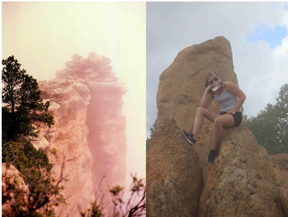
location: Grand Canyon, Utah