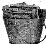
Post-enforcement action professional fees and expenses