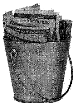
Pre-enforcement action professional fees and expenses