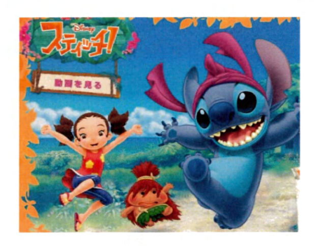
Figure 4. Yuna