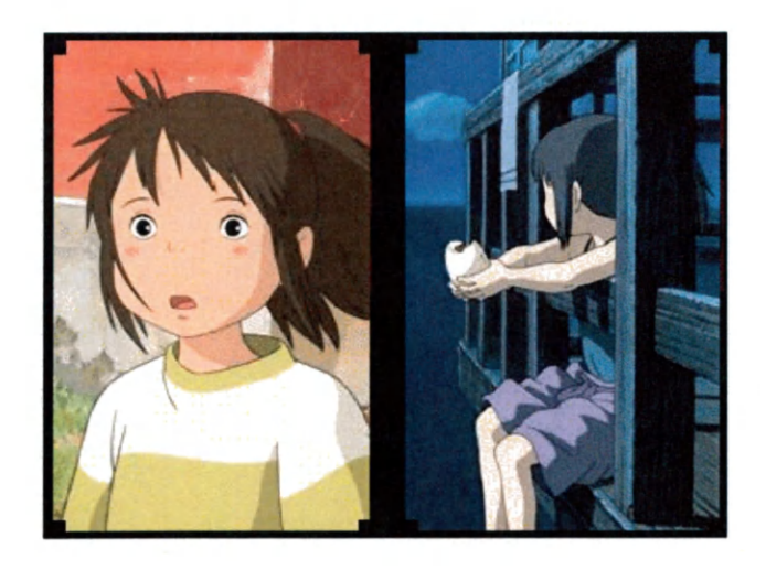
Figure 3. Chihiro