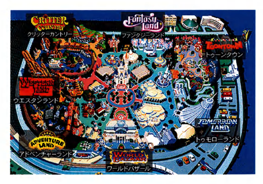
Figure 2. Map of Tokyo Disneyland