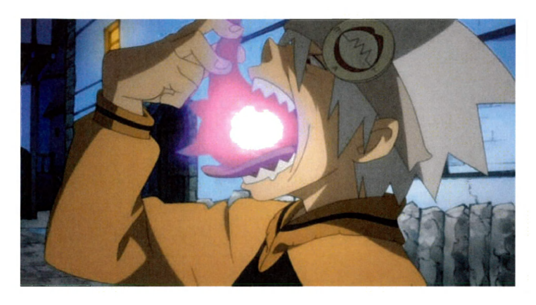
Figure 9. Soul Evans