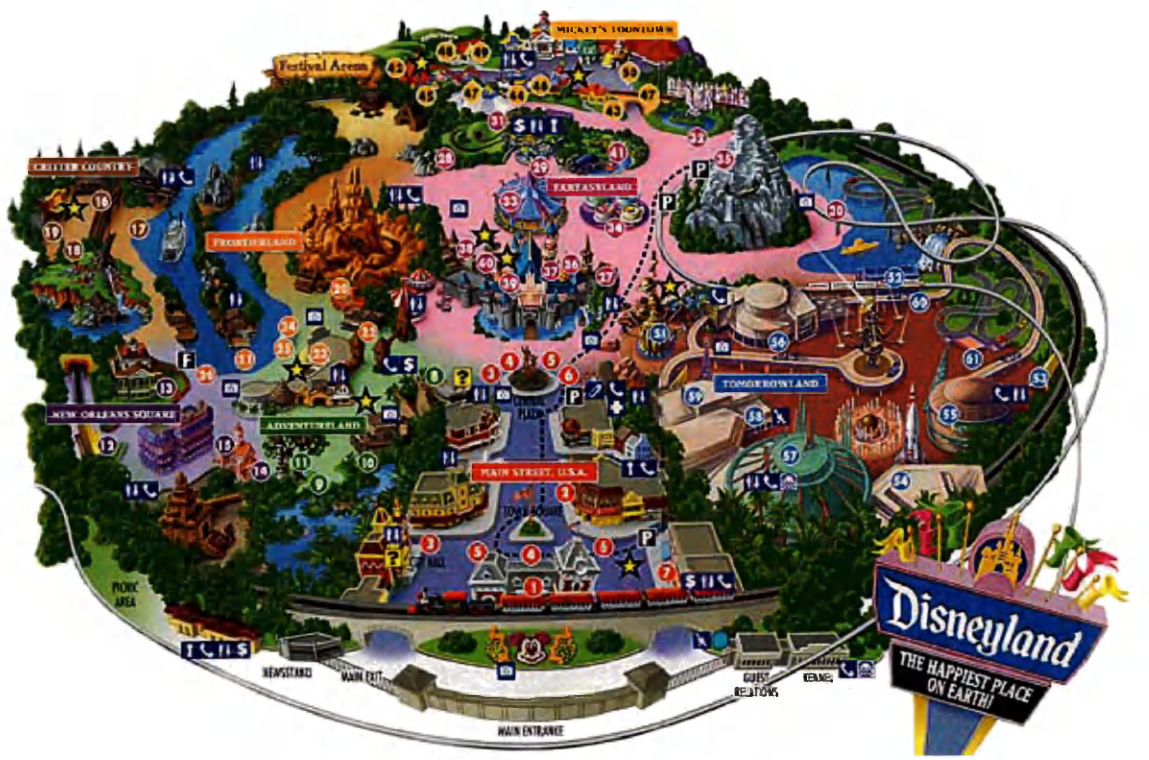
Figure 1. Map of Disneyland in Anaheim, California