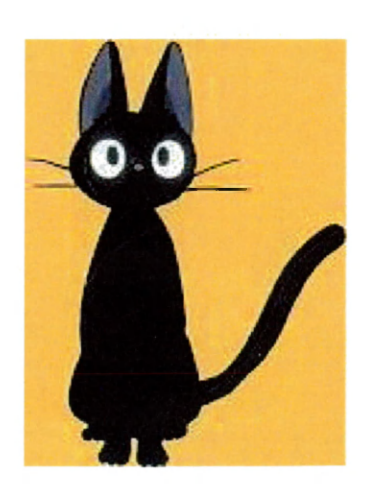
Figure 8. Jiji