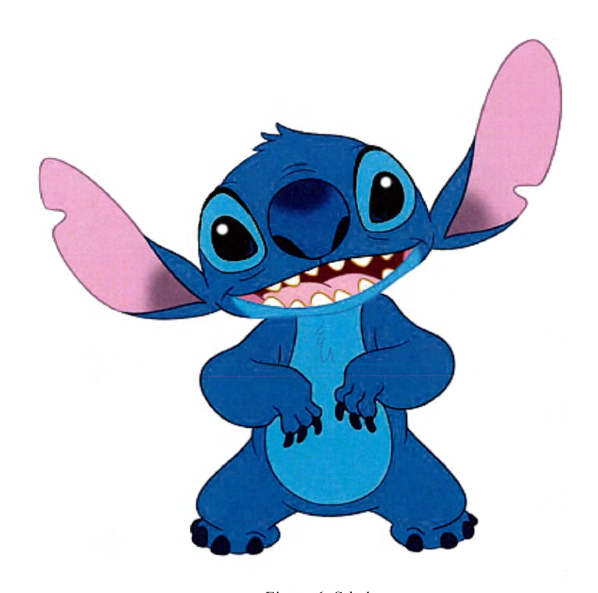
Figure~6.~Stitch\\ From: \\ http://animatingthecyborg.files.wordpress.com/2009/04/17_lilo_und_stitch_500_375\_the_disney\_channel1.jpg