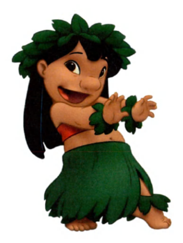
Figure 5. Lilo