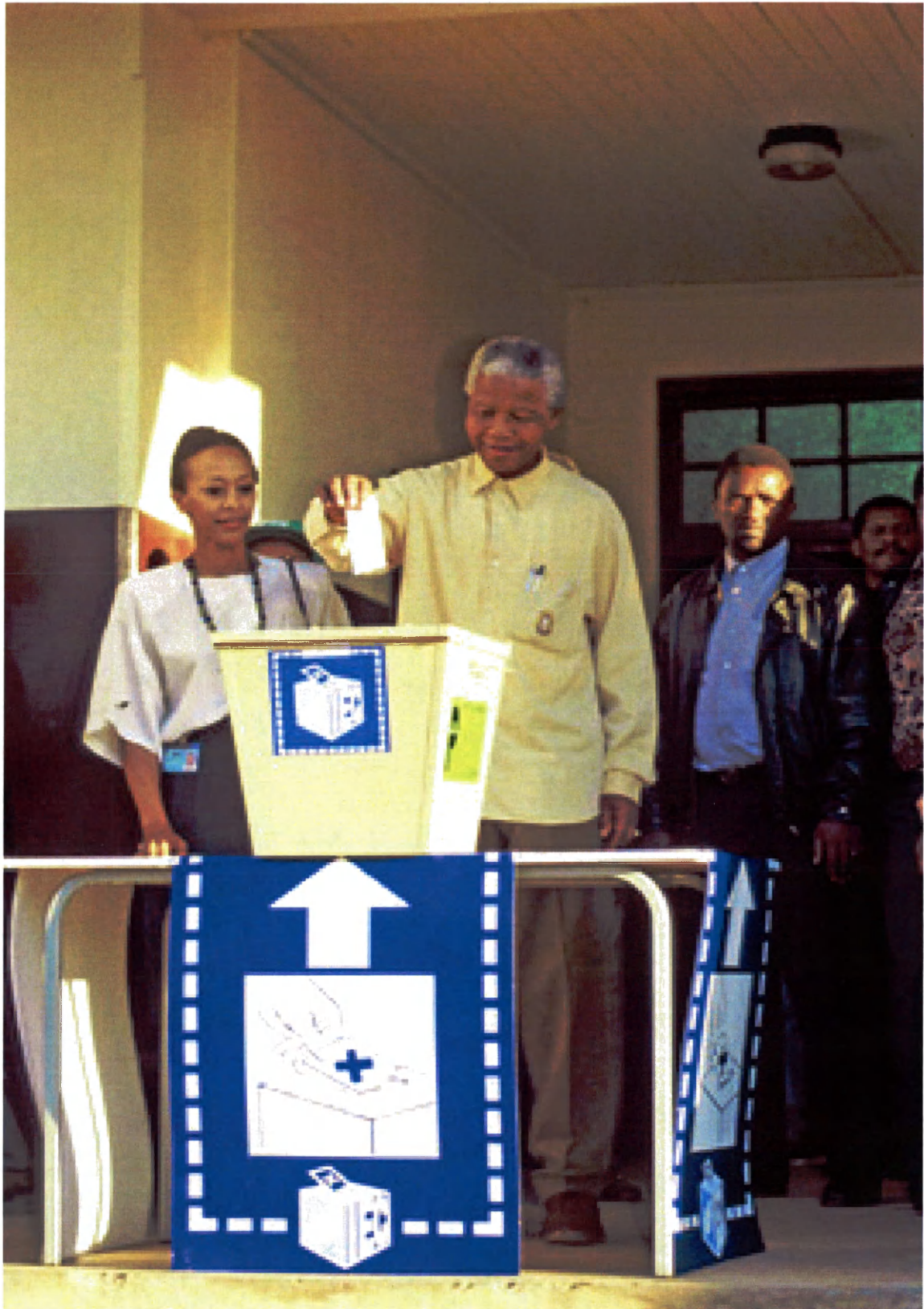
United Nations photo archives